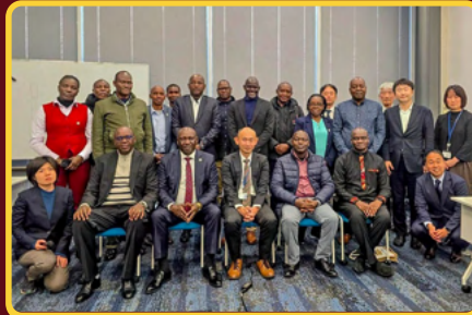
Pg 12 NPS JOINS JICA FOR THEIR VOLUNTEER PROGRAMME'S DIAMOND JUBILEE CELEBRATIONS