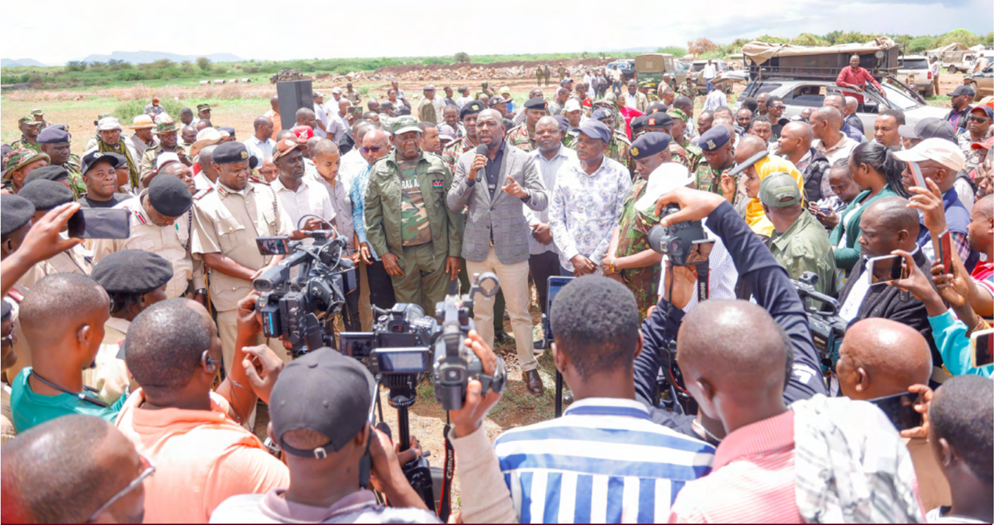
CS Interior, Hon. Kipchumba Murkomen, addressing residents of Meru during a security assessment of Meru County, on March 23, 2026