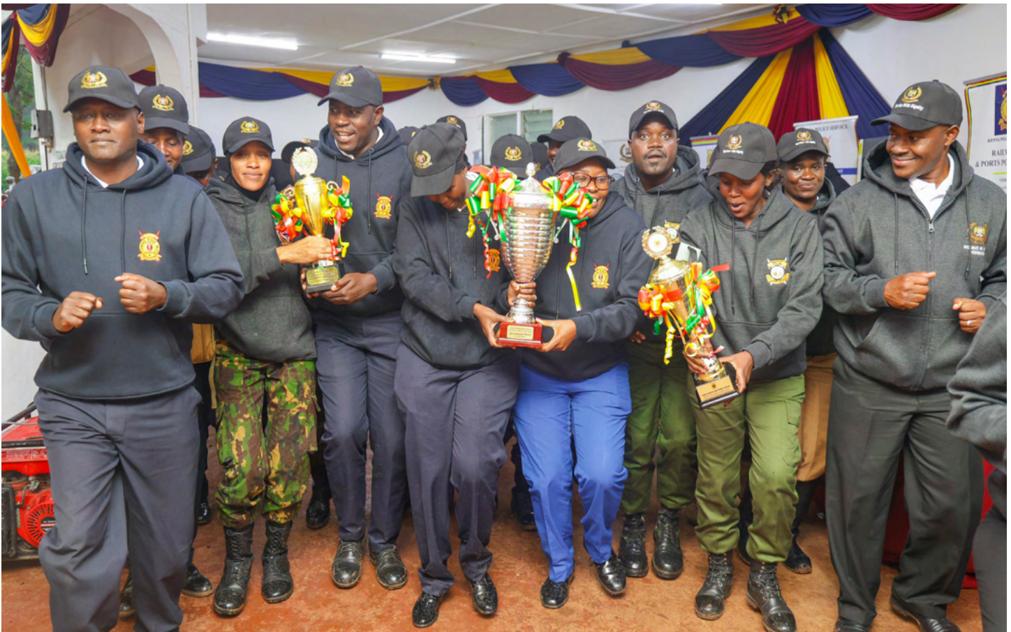
NPS exhibitors celebrating trophies won at the 2026 Eldoret National ASK Show, held at the Eldoret Showground in Uasin Gishu County.