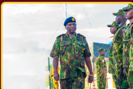
Pg 6 NPS OFFICERS HONoured AS HAITI MISSION DRAWDOWN GAINS MOMENTUM