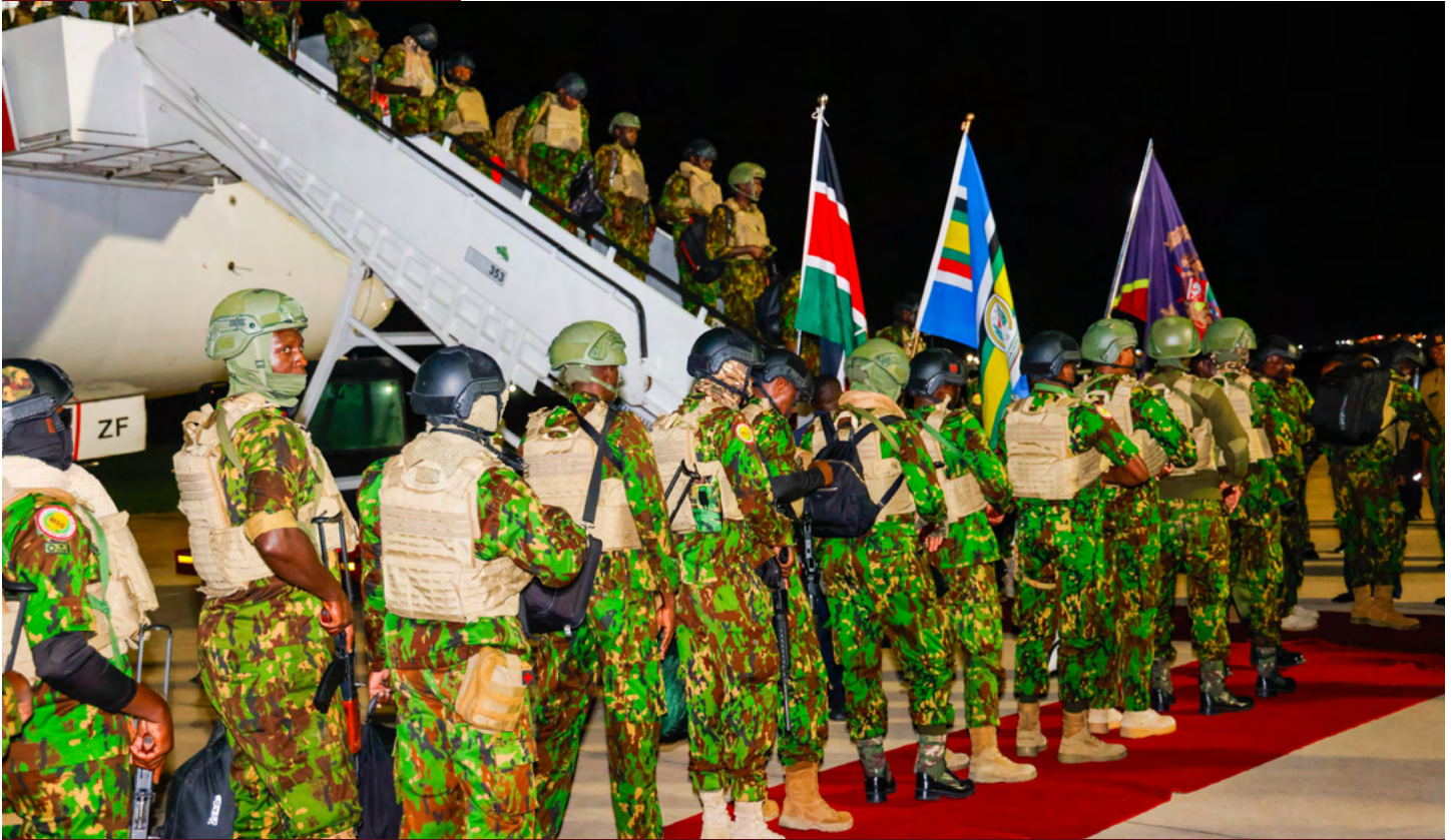
National Police Service MSS officers during their touchdown from Haiti at Jomo Kenyatta International Airport