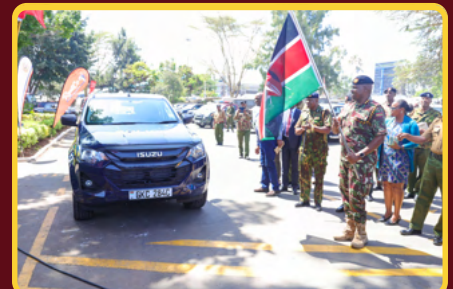
Pg 16 NPS RECEIVES 95 VEHICLES UNDER PHASE VII OF MOTOR VEHICLE LEASING PROGRAMME