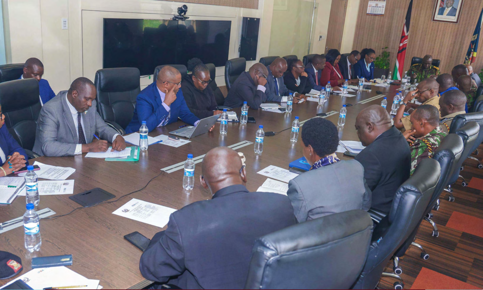
Senior officers of the National Police Service (NPS), and the Independent Policing Oversight Authority (IPOA) during the recent biannual engagement meeting held on March 3, 2026, at Jogoo House, Nairobi chaired by Inspector General of Police, Mr. Douglas Kanja.

noting that all police operations must remain within legal and professional standards.