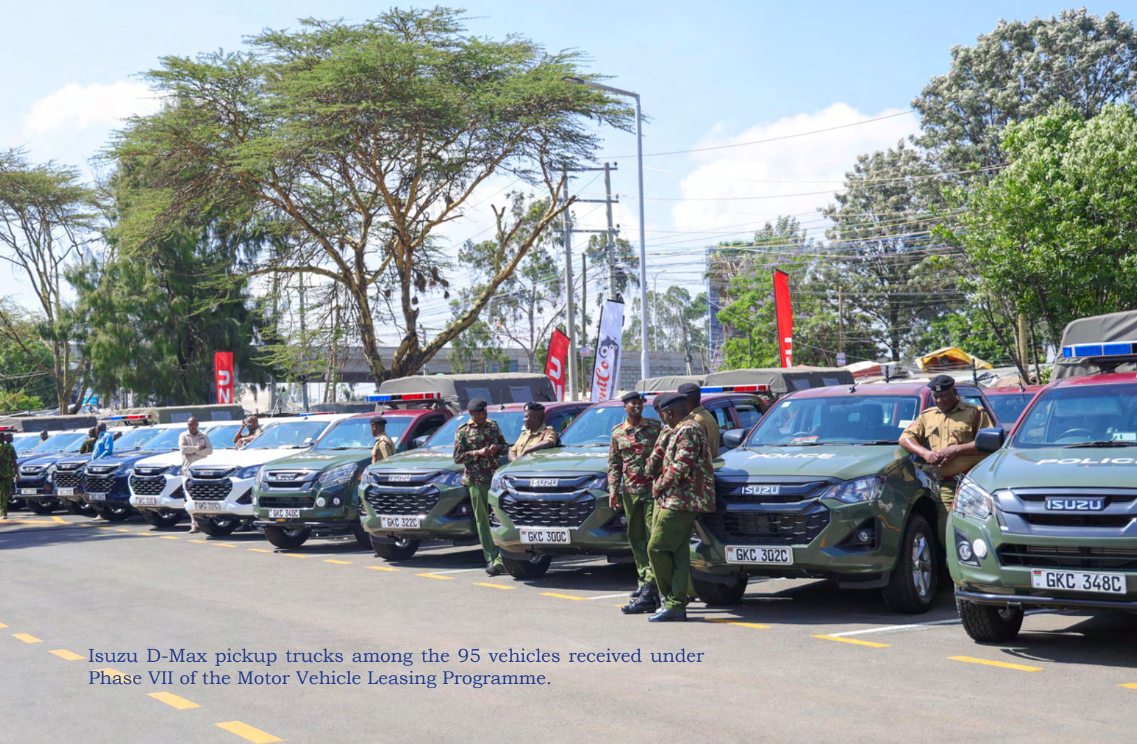
Isuzu D-Max pickup trucks among the 95 vehicles received under Phase VII of the Motor Vehicle Leasing Programme.

As Phase VII progresses, the flag-off of the 95 vehicles is more than a logistical milestone. It is a reaffirmation of the government’s commitment to sustained security sector reforms, ensuring the National Police Service remains responsive, efficient, and capable of addressing evolving security challenges.