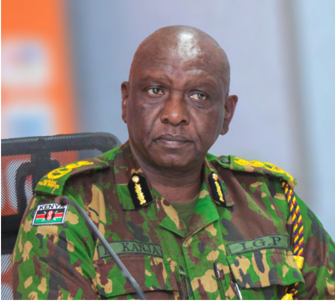
MR. DOUGLAS KANJA KIROCHO, MGH, CBS, OGW INSPECTOR GENERAL NATIONAL POLICE SERVICE

It is my pleasure to present the 18th edition of the National Police Service Newsletter, which highlights the continued progress we are making in strengthening policing, enhancing service delivery, and deepening our commitment to professionalism, accountability, and community partnership.