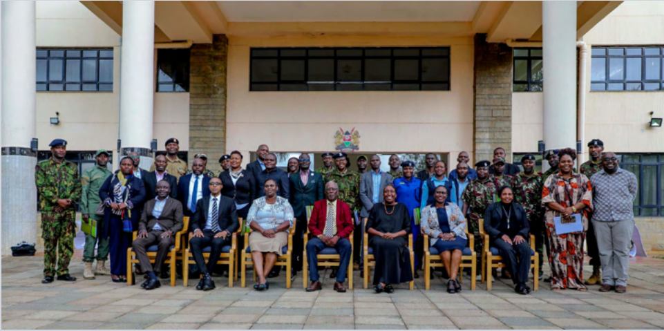
Officers from NPS training institutions pose for a group photo during an internal validation exercise for the POLICARE Service Provider Training Curriculum at the KSG, Kabete.

The National Police Service (NPS) is demonstrating its unwavering commitment to gender equality, institutional transformation, and improved service delivery through strategic partnerships and innovative training initiatives.