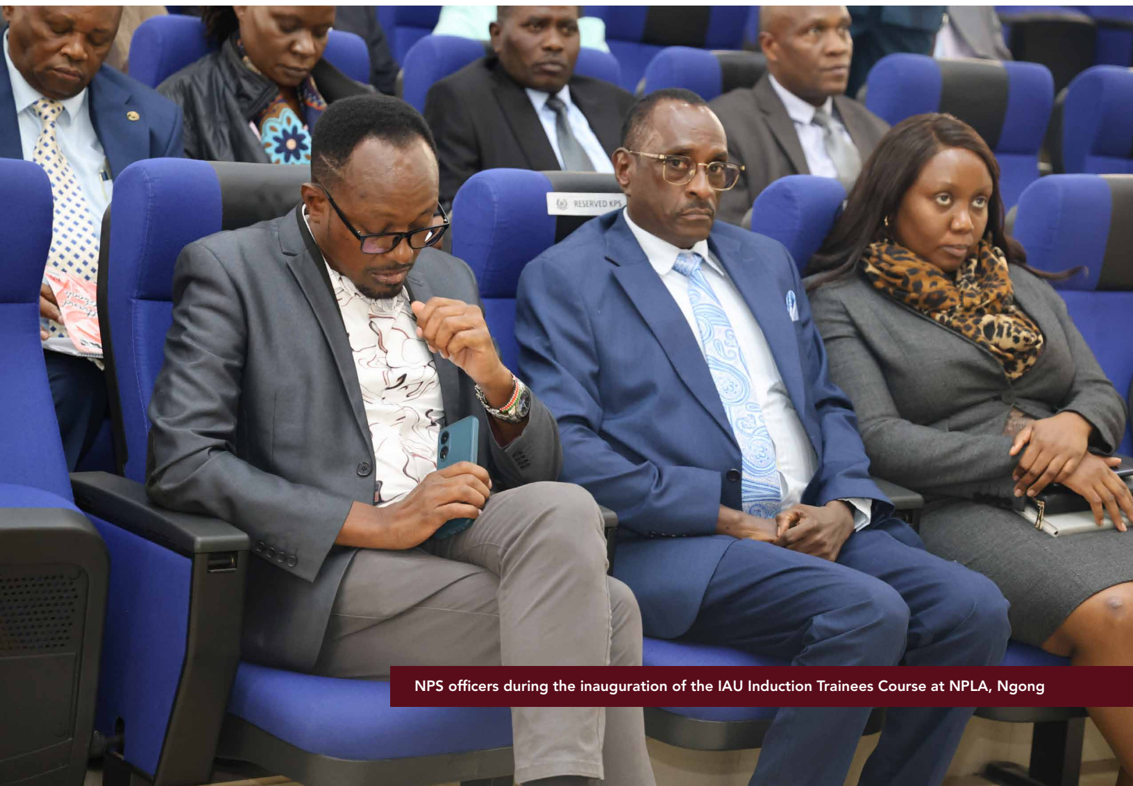
NPS officers during the inauguration of the IAU Induction Trainees Course at NPLA, Ngong

The successful completion of this induction course represents a crucial advancement in equipping the Internal Affairs Unit to maintain the utmost standards of accountability and integrity, ensuring that the National Police Service remains a reliable institution committed to justice and the rule of law.