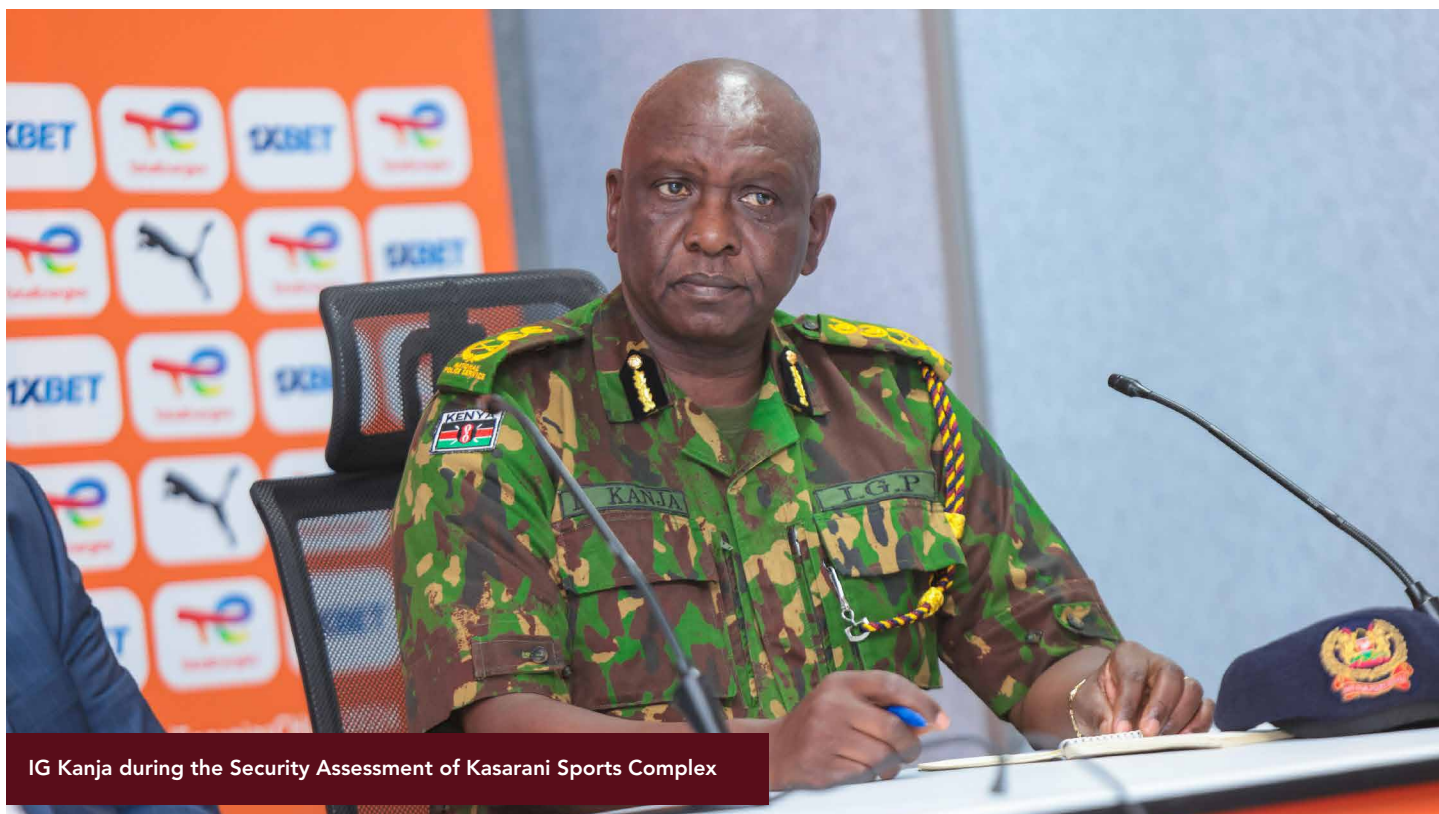
IG Kanja during the Security Assessment of Kasarani Sports Complex