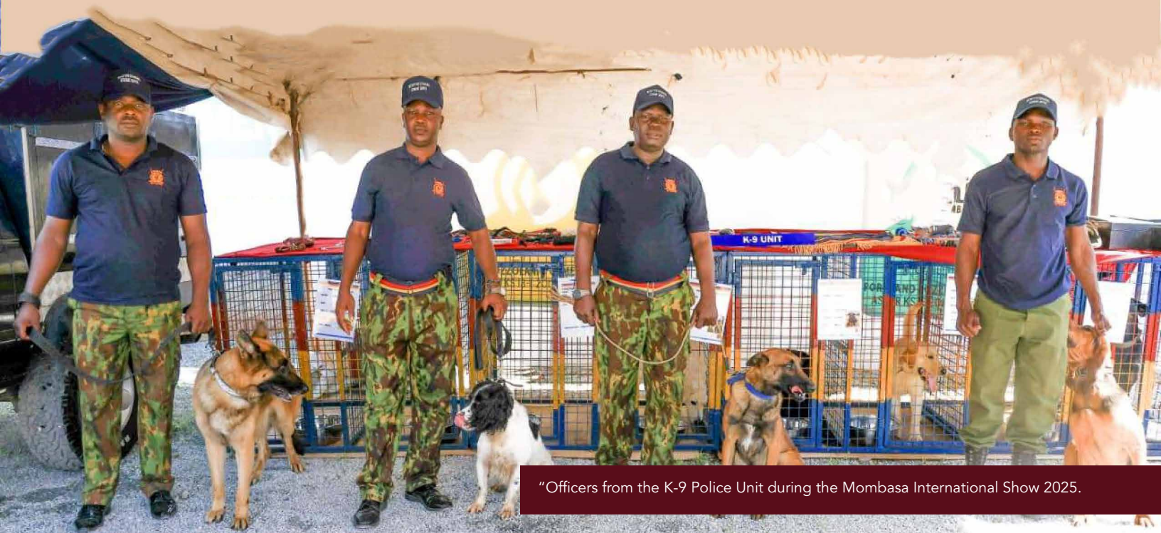
"Officers from the K-9 Police Unit during the Mombasa International Show 2025."

With each sweep, each patrol, and every detection, the Kenya Police K-9 Unit exemplifies dedication, bravery, and determination – truly living up to the name “Paws of Pride.”