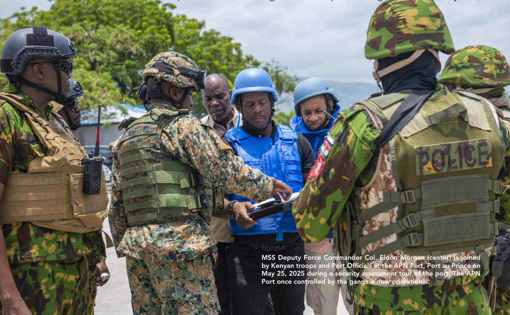
MSS Deputy Force Commander Col. Eldon Morgan (center) is joined by Kenyan troops and Port Officials at the APN Port, Port au Prince on May 25, 2025 during a security assessment tour of the port. The APN Port once controlled by the gangs is now operational.

Through the tireless efforts of NPS troops and our collaboration with the Haitian National Police, there has been a significant reduction in violent gang attacks, sustained government operations, and maintenance of the rule of law by the Haitian National Authorities. The troops have thwarted plans by gang groupings to undermine the current government in place,