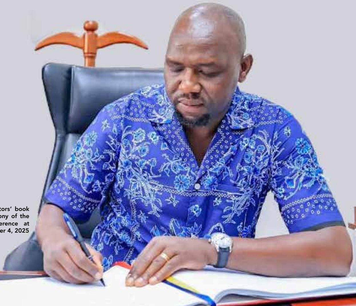
CS Murkomen signing visitors' book during the Closing Ceremony of the OCS's Consultative Conference at NPLA, Ngong, on September 4, 2025

The reforms emphasised include the digitisation of police operations, featuring the implementation of the Digital Occurrence Book (DOB), an extensive Case Management System, and secure mobile applications aimed at enhancing efficiency and transparency