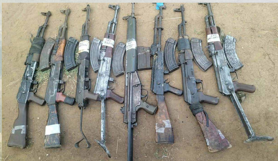
Some of the firearms surrendered during the disarmament exercise in the North Rift.

A Significant Advancement Towards Enduring Security