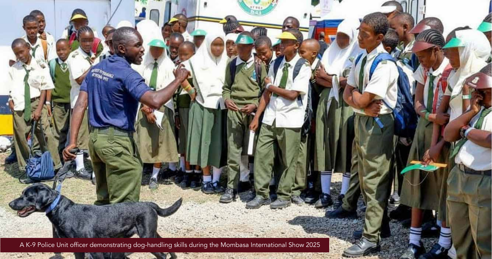
A K-9 Police Unit officer demonstrating dog-handling skills during the Mombasa International Show 2025