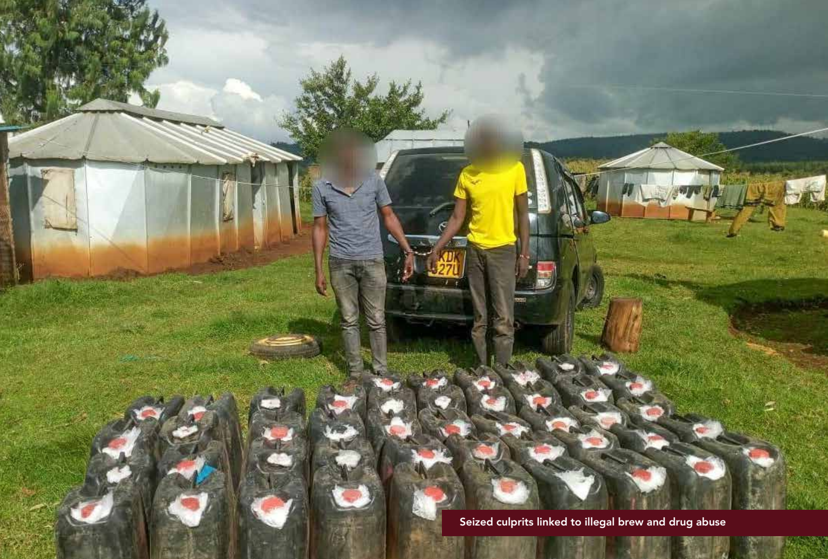
Seized culprits linked to illegal brew and drug abuse