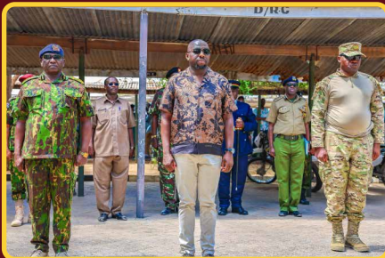
Pg 6 Jukwaa la Usalama