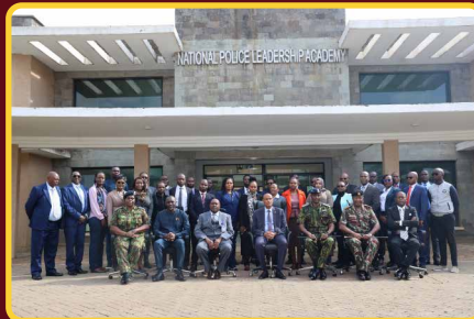
Pg 8 Internal Affairs Unit Successfully Completes Induction Programme