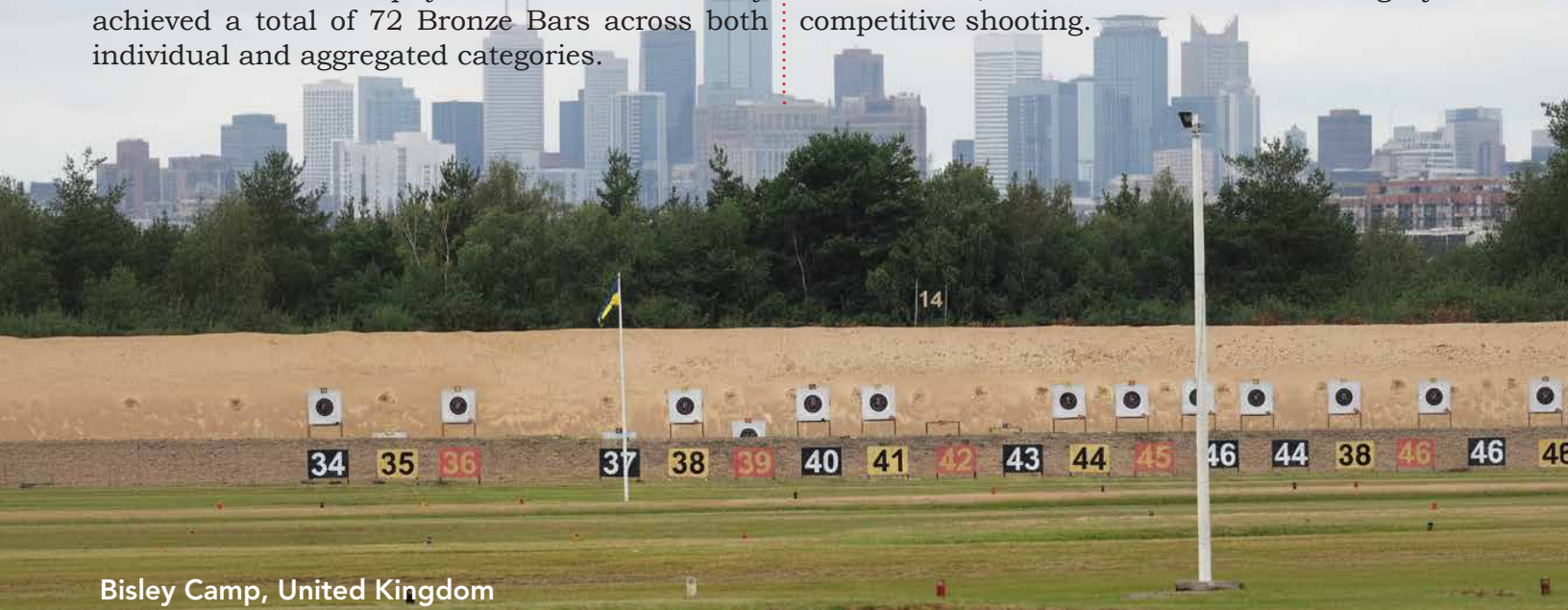
Bisley Camp, United Kingdom

In the upcoming years, the NPS has scheduled a robust shooting calendar for 2025/2026, which includes both local competitions and international tournaments, as it aims to enhance its legacy in competitive shooting.