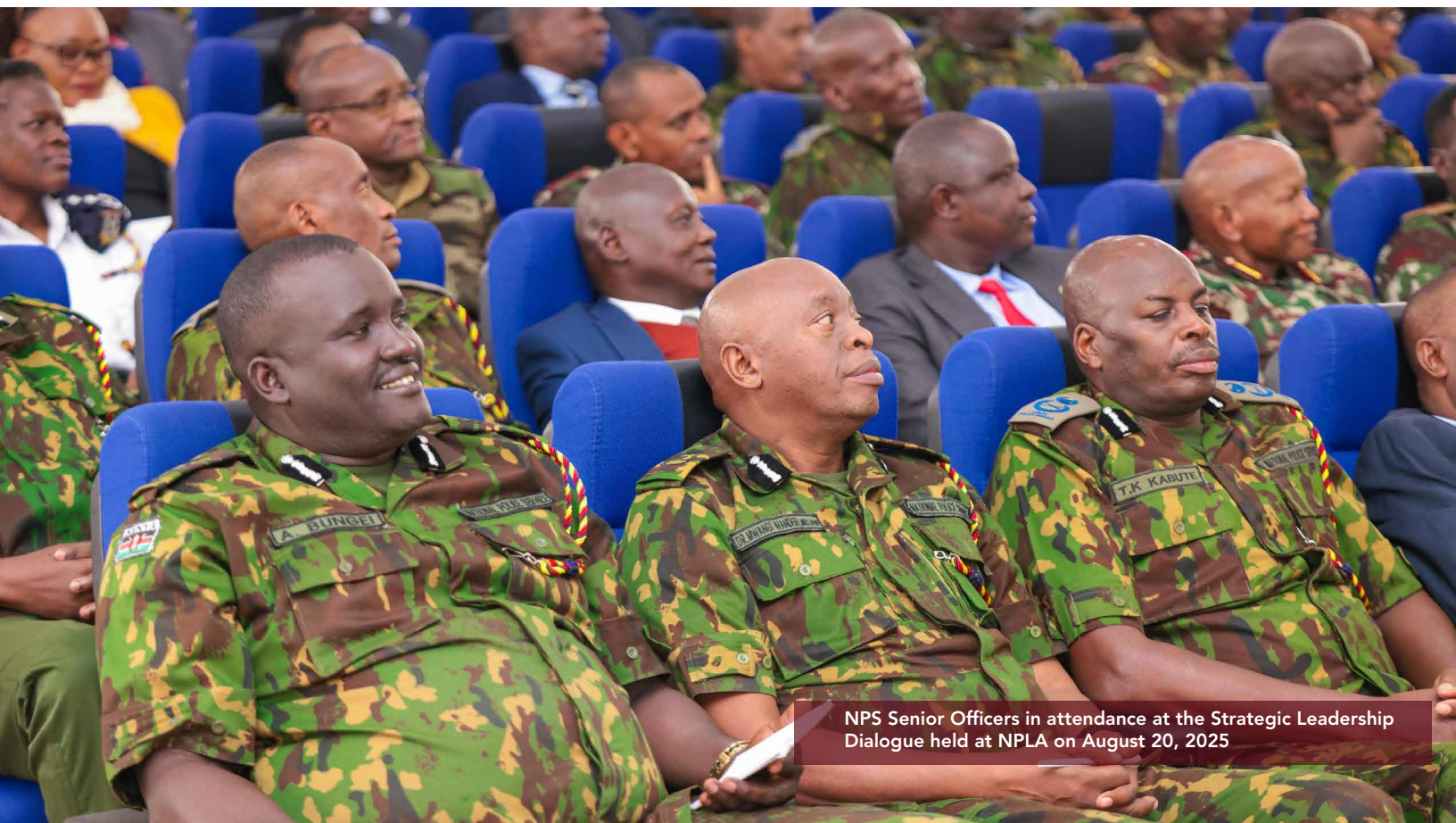
NPS Senior Officers in attendance at the Strategic Leadership Dialogue held at NPLA on August 20, 2025

The Strategic Leadership Dialogue in Ngong served as a significant reaffirmation of the Service’s dedication to transforming policing in Kenya. It illustrated how effective leadership, supportive policies, and collaborative development are creating a future in which the NPS serves as a cornerstone of accountability, expertise, and public confidence. The Service is committed to investing in its personnel and systems, progressively guiding the transition towards a contemporary police service that aligns with the expectations of Kenyans and maintains its obligation to serve with integrity.