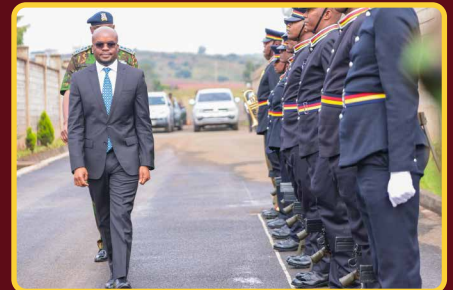
Pg 10 NPS Conducts a Strategic Leadership Dialogue at the NPLA