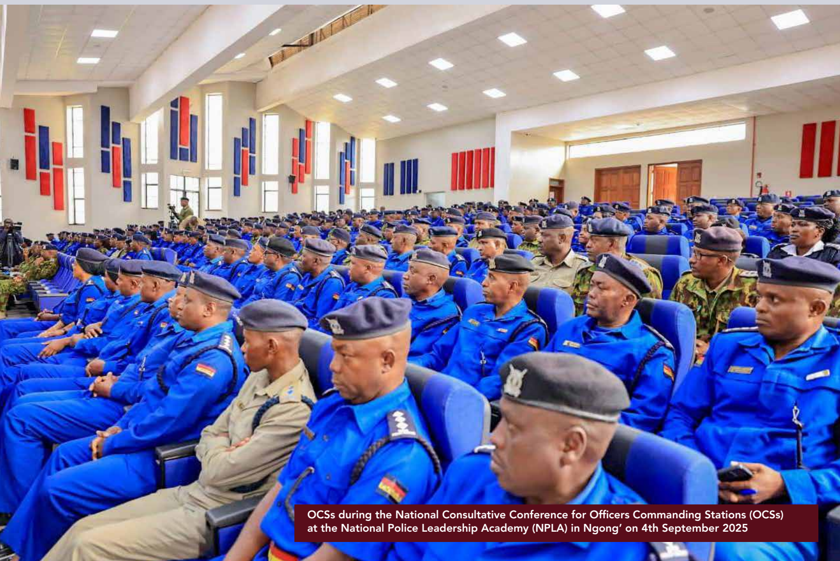
OCSs during the National Consultative Conference for Officers Commanding Stations (OCSs) at the National Police Leadership Academy (NPLA) in Ngong' on 4th September 2025

The event attracted the involvement of the Deputy Inspectors General from both the Kenya Police Service and the Administration Police Service, senior directors from NPS headquarters, and the Commandant of the NPLA, highlighting the significant emphasis placed on empowering OCSs as key leaders in policing across Kenya.