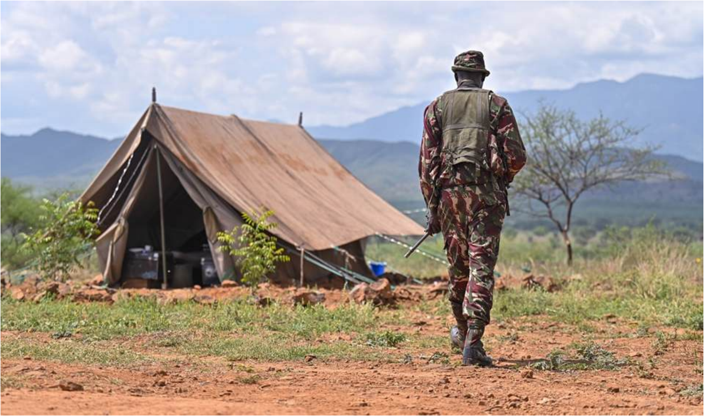
NPS officer patrols inside a camp in Baringo county.