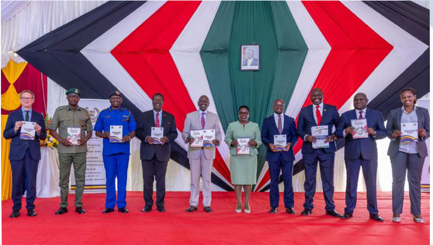
His Excellency Dr William Ruto, President of the Republic of Kenya and Commander-in-Chief of the Defence Forces joins the National Police Service during the launch of 2023-2027 Strategic Plan at Kenya School of Government,

The National Police Service, a key national security organ launched its 2023- 2027 Strategic Plan on Friday, December 13, 2024, during a ceremony held at the Kenya School of Government-Lower Kabete, Nairobi.