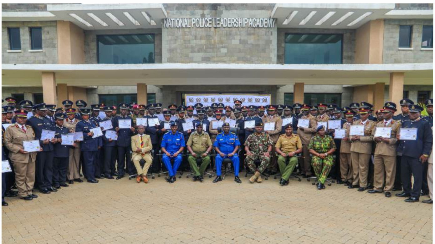
NPS Leadership pose for a photo during the closing of National Police Service County Commanders' Course No. 1/2024 at the National Police Leadership Academy- Ngong' on December 20, 2024

In order to stay effective and efficient in today's modern policing, training and development are a necessity. These processes not only enhance skills and knowledge but also empower individuals and teams to adapt and thrive in an increasingly complex world.