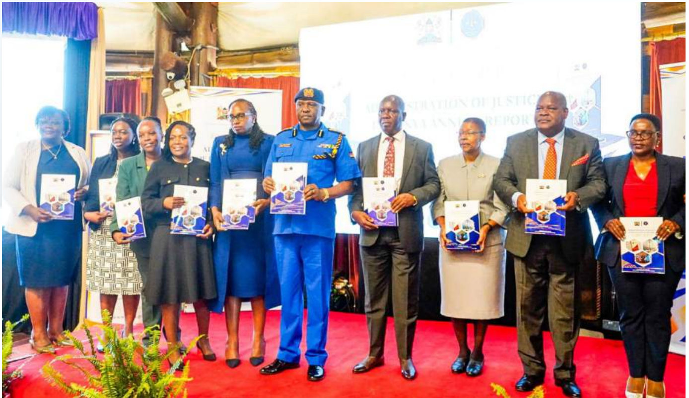
Inspector General of Police Mr. Douglas Kanja represents National Police Service during the launch of NCAJ Annual Report 2023-2024 at Safaripark Hotel on November 6, 2024

T he Inspector General of Police Mr. Douglas Kanja on behalf of National Police Service on November 6, 2024 attended the launch of the National Council for the Administration of Justice (NCAJ) annual report at the Safari Park Hotel in Nairobi.