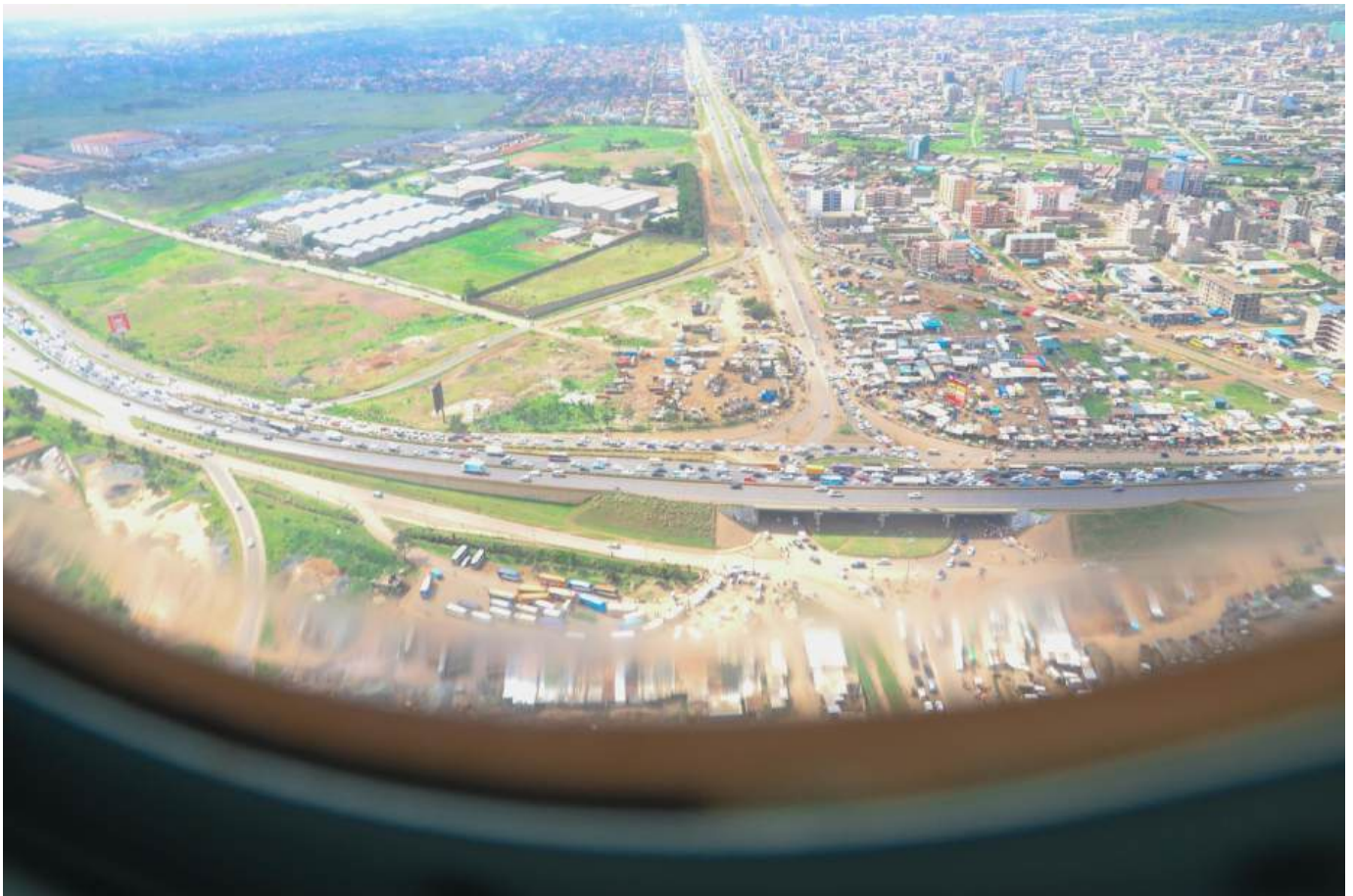
Ariel view... A police chopper conducts air surveillance of major highways during the festive season