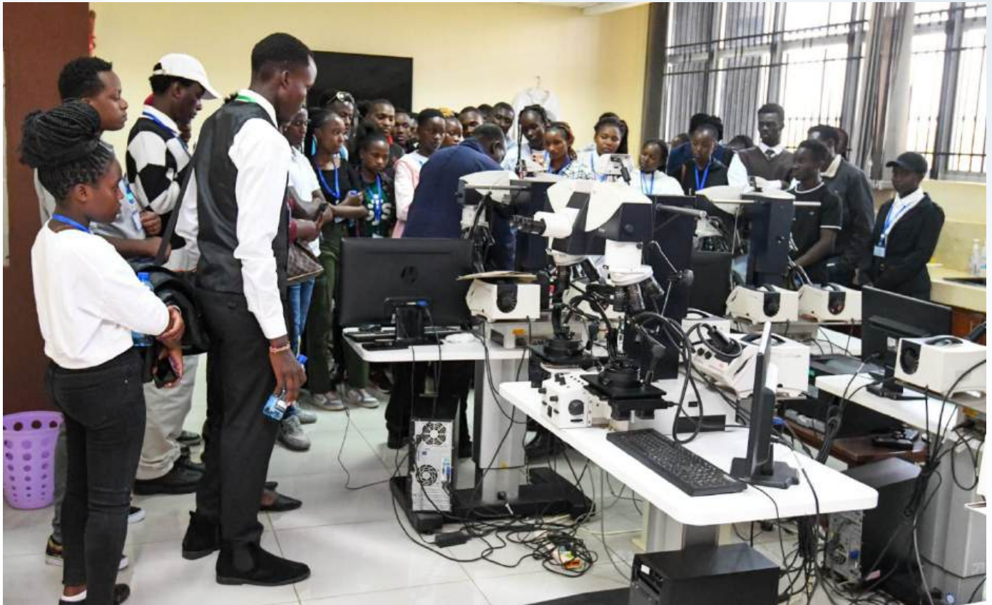
The second-year students at Egerton University's Department of Peace, Security, and Social Studies take a tour of the National Forensic Laboratory at the DCI Headquarters on October 31, 2024

courses undertaken by the Multi-National Security Support Mission team set to join their counterparts in Haiti to equip them with necessary language skills and cultural awareness to ensure a smooth transition as they undertake their duties in Haiti.