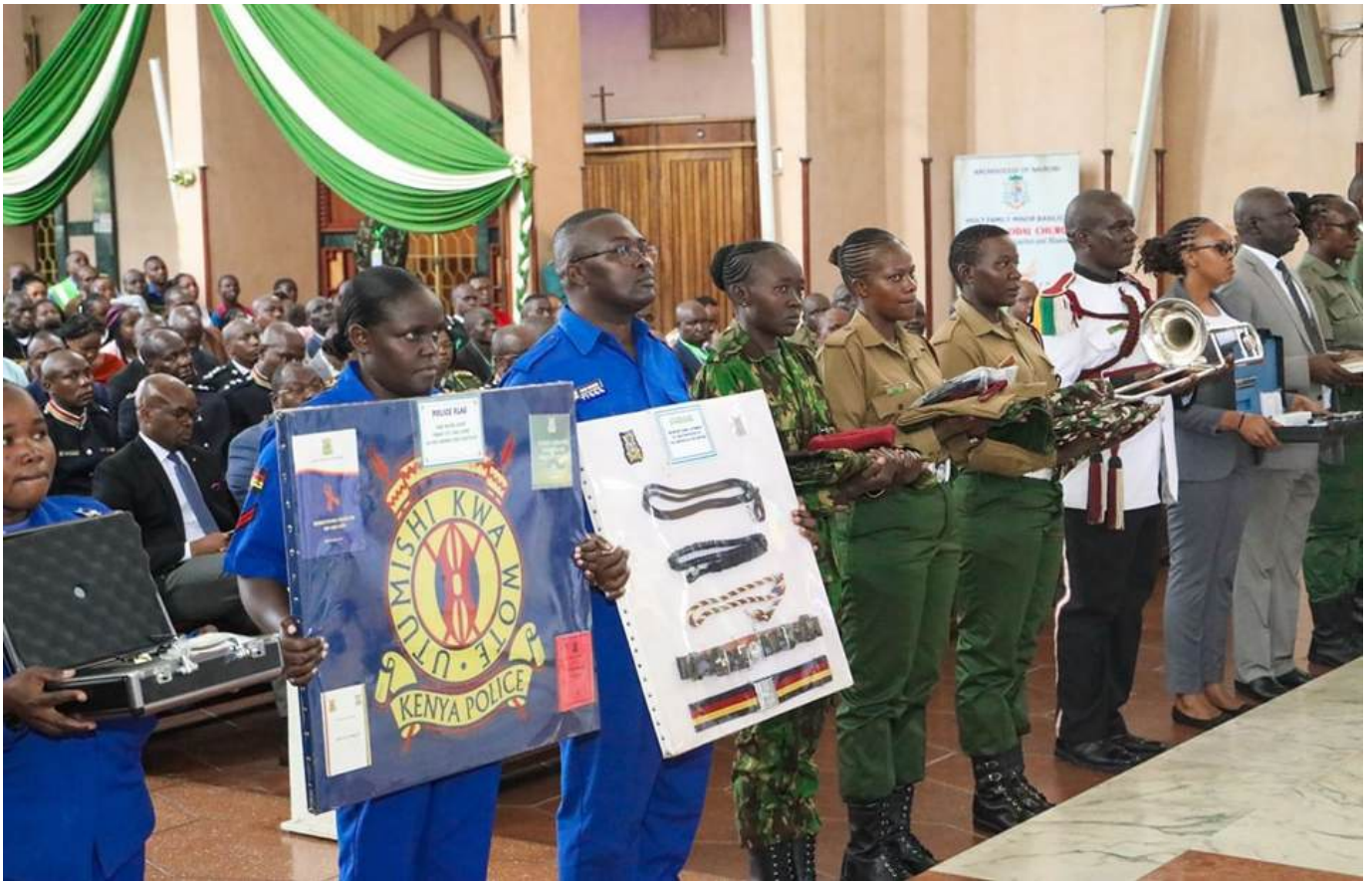
NPS Officers display kit used by officers in their line of duty during Joint Thanksgiving Service in Nairobi on November 9, 2024 Below: DIG-KPS Mr. Eliud Lagat with NPS Corporate Communications team during an assignment in Eldoret, Uasin Gishu County on December 7, 2024