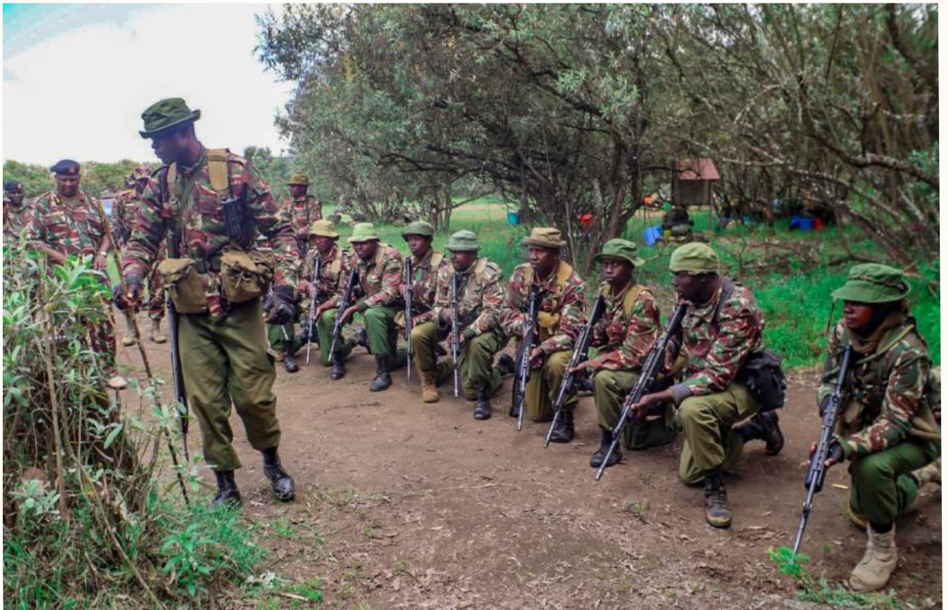
Administration Police Officers take part in the Fieldcraft and Tactics Course 2/2024

Directorate and the Directorate of Public Prosecutions were trained at Border Police Training Campus - ATA Centre in Kanyonyoo, Kitui County. The course was designed to equip the participants with vital knowledge on IED threats, enhance their skills and fortify strategies to safeguard lives against