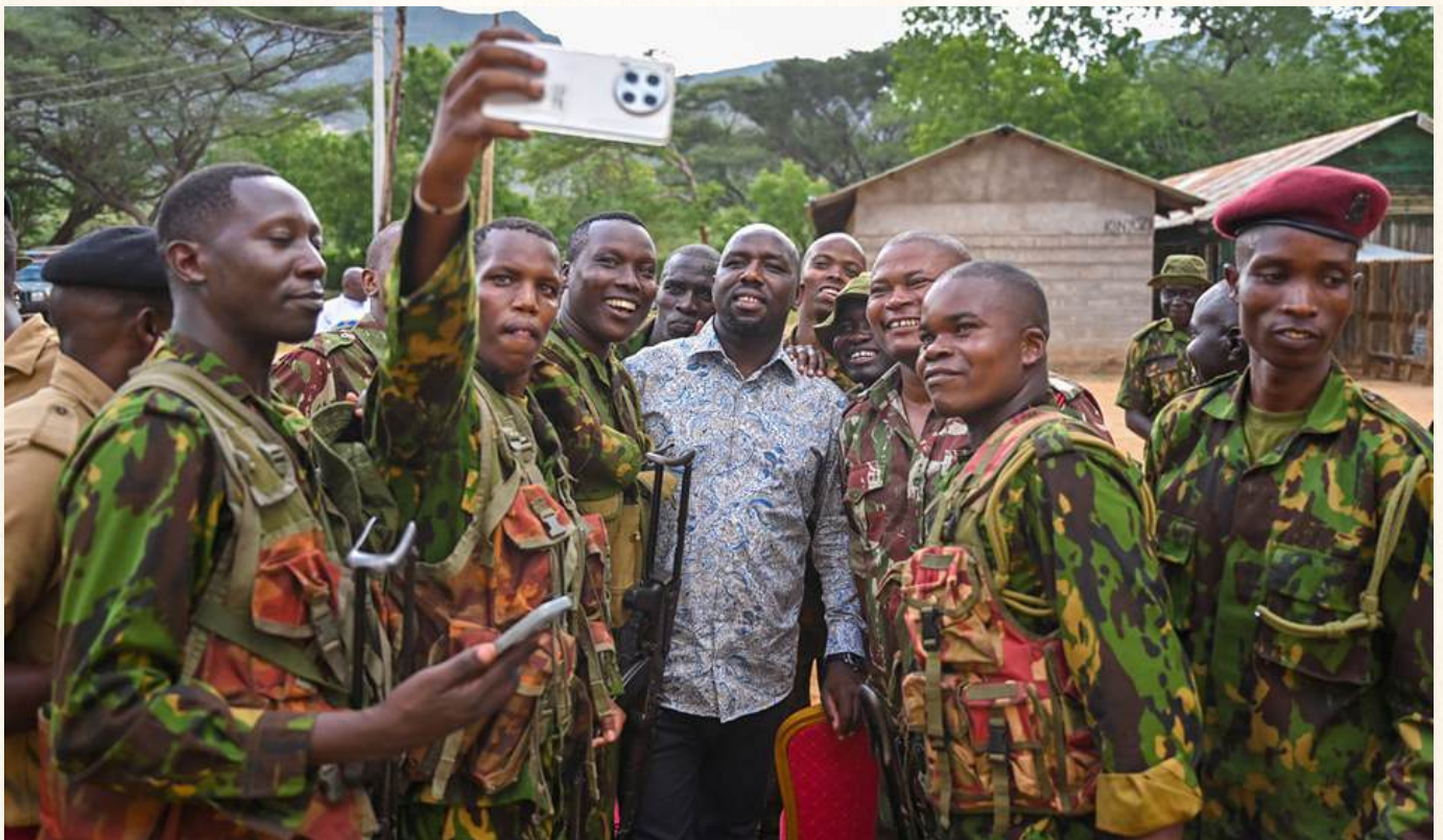
CS Interior Hon. Kipchumba Murkomen takes a selfie with a section of police officers during his tour of Baringo County on December 25, 2024

The Cabinet Secretary Ministry of Interior and National Administration Hon. Kipchumba Murkomen on December 25, 2024 made his first official tour of duty since taking office by visting NPS