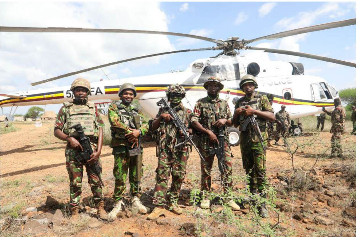
Officers pose for a photo with a police helicopter during the visit of CS Interior Hon. Kipchumba Murkomen in Baringo County on December 25, 2024