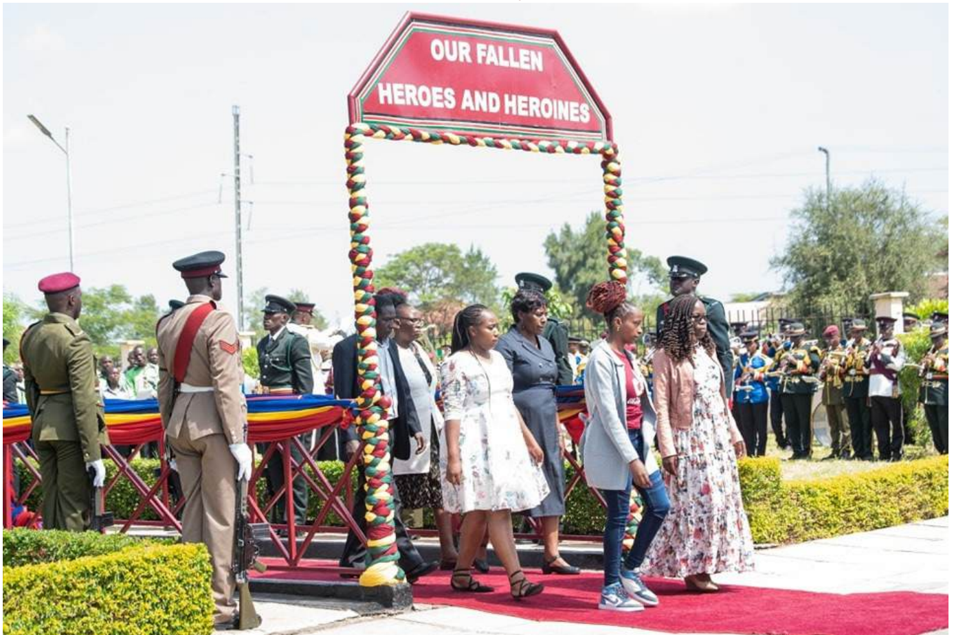
Families of Fallen Heroes walk back from laying a wreath at a monument in commemoration of officers who lost their life in the line of duty at NPC Embakasi A Campus on December 6, 2024

The National Police College – Embakasi 'A' Campus hosted the fifth joint commemorative service on December 6, 2024, honoring fallen heroes of NPS and the Kenya Prisons Service. The two Services joined families of the fallen heroes on what was a day of remembrance and honor for the brave men and women who gave their lives in service.