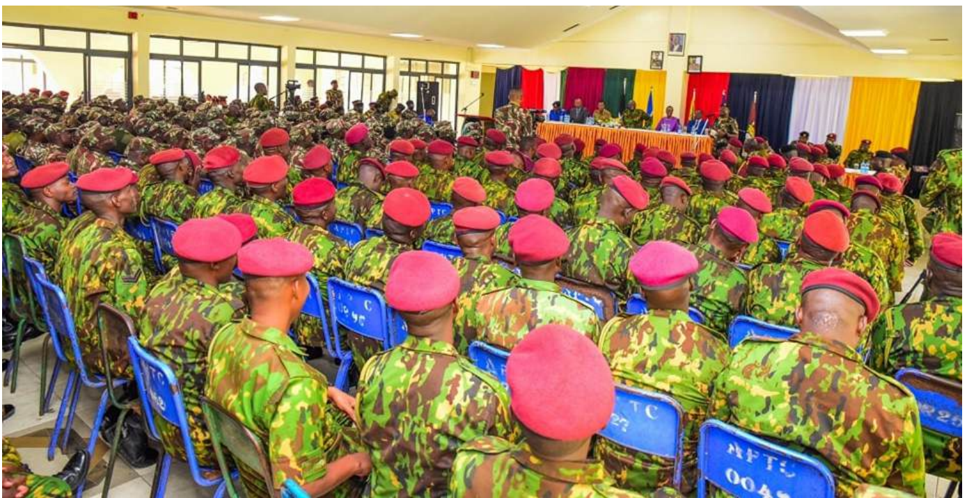
NPS officers attend the closing of the pre-deployment training course ahead of their deployment to MSSM in Haiti held at NPC Embakasi A Campus on November 8, 2024

S even months have elapsed since the first contingent of NPS Officers arrived in Haiti to be part of the UN-mandated, Kenyan-led Multinational Security Support Mission (MSSM) in the Republic of Haiti. During this period, the MSS Officers comprising Kenyan Police and Haitian National Police, including Jamaica, Guatemala, El Salvador, Bahamas and