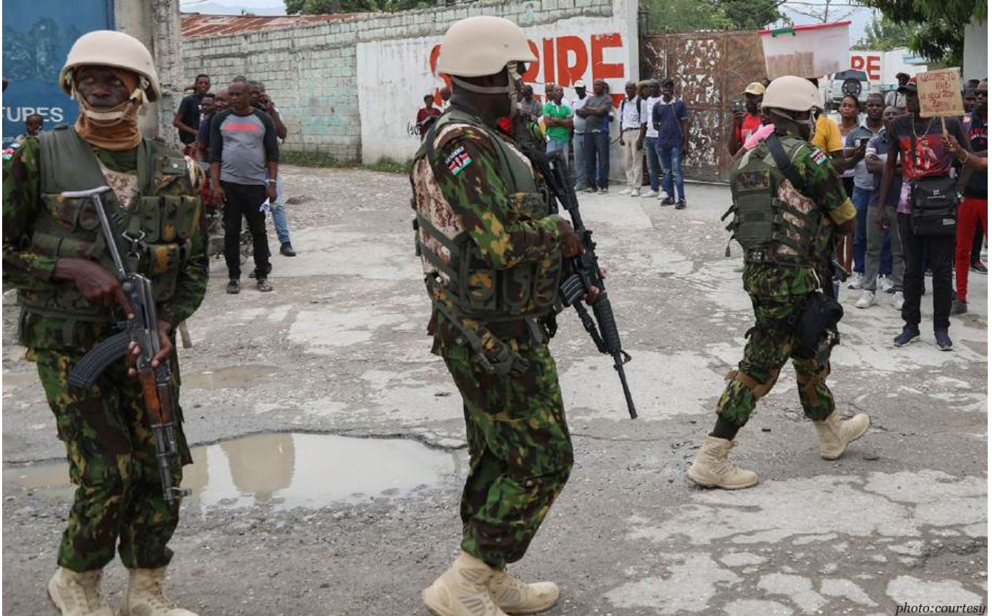
NPS officers on Patrol in the streets of Haiti

He further assured the officers of support in the mission, promising continued rallying of the International Community to address Haiti's plight, and wished the officers success in the assignment.