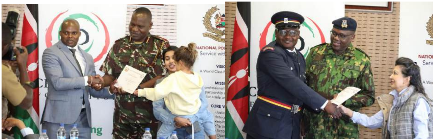
Some of the officers who were awarded during the Chandaria Bravery Awards receive their certificates during the award ceremony

“Courage is not the absence of fear but rather the assessment that something else is more important than fear.” – Franklin D. Roosevelt.