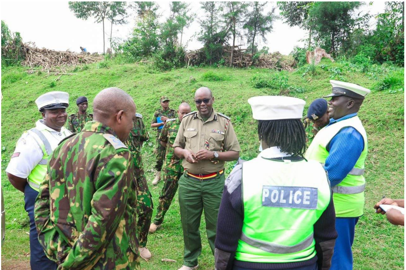
DIG Lagat makes a stop to check on traffic officers at Kapkangani area under Kapsabet patrol base on his way to Kisumu County on August 16, 2024

His visits include inspection of critical areas including the report office which is the front desk at police stations where members of the public are received to make their reports , Child Protection Units established to provide safe and non-threatening environment for children, Gender Desks meant to provide a safe space for victims of sexual and gender-based violence, cells which are the temporary holding facilities for suspects awaiting arraignment in court.