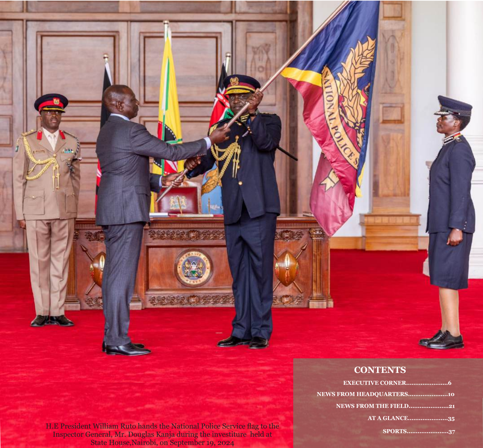
H.E President William Ruto hands the National Police Service flag to the Inspector General, Mr. Douglas Kanja during the investiture held at State House, Nairobi, on September 19, 2024