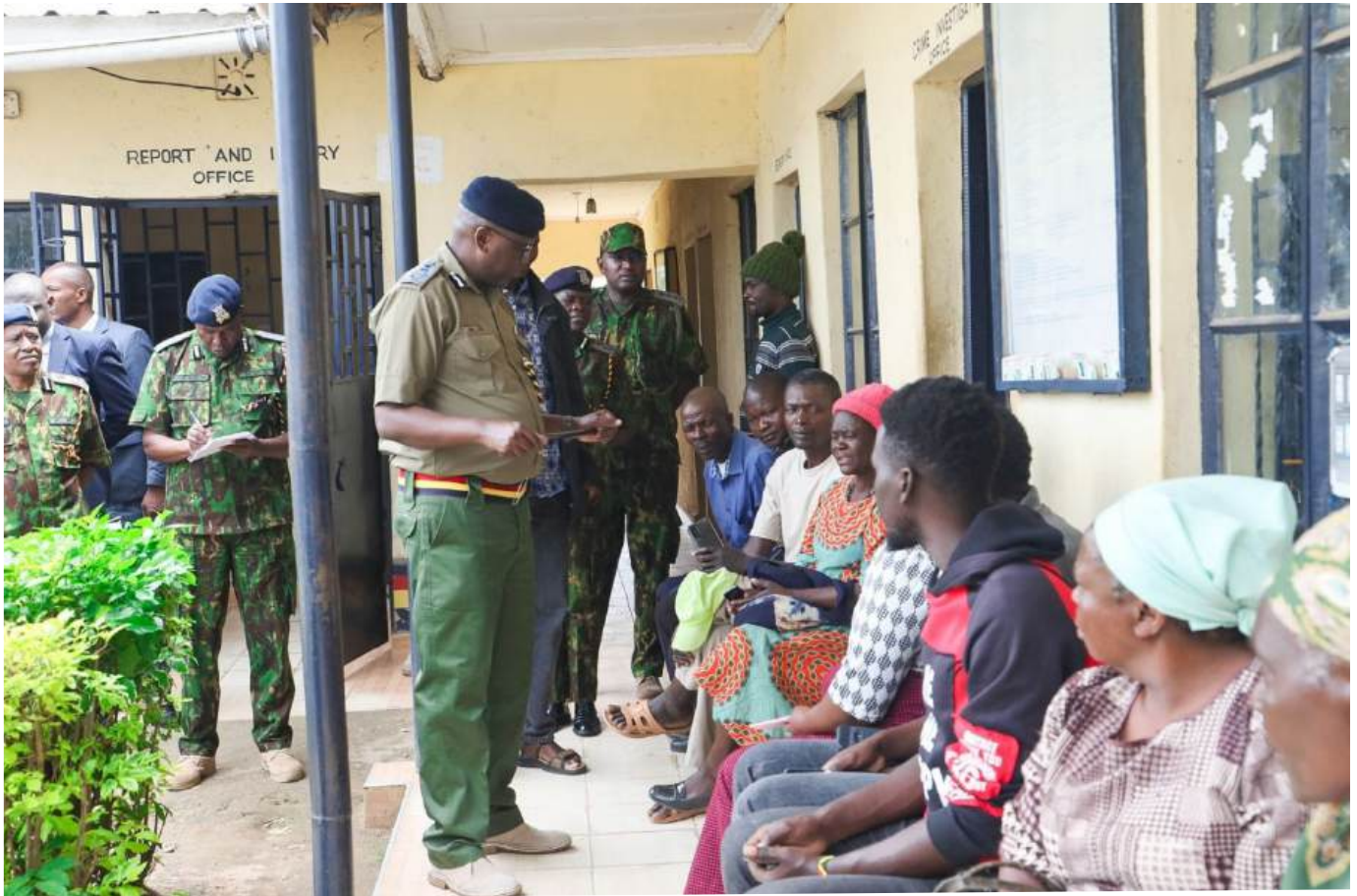
DIG Lagat chats with members of the public seeking services at Cheptulu Police Station in Western Region on August 16, 2024

During this time, the DIG also conducted a number of night visits to police stations including Kilimani and Nanyuki Police Stations. At Nanyuki Police Station, the Kenya Police Chief was particularly impressed by the well-maintained Policare Centre at the latter, a specialized one-stop centre for handling sexual and gender-based violence cases on a secluded space away from the mainstream police station, in a bid to offer privacy and dignity to victims of SGBV.