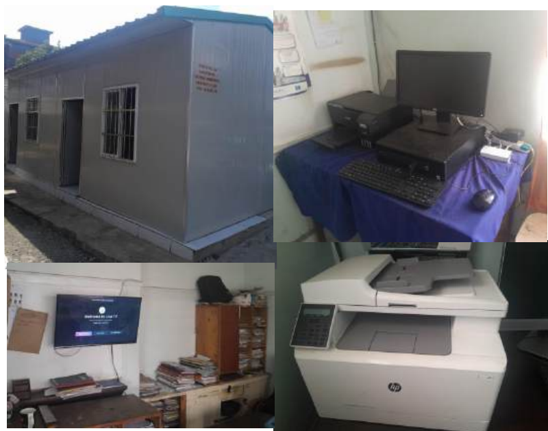
Some of the items donated to DCI Kilimani