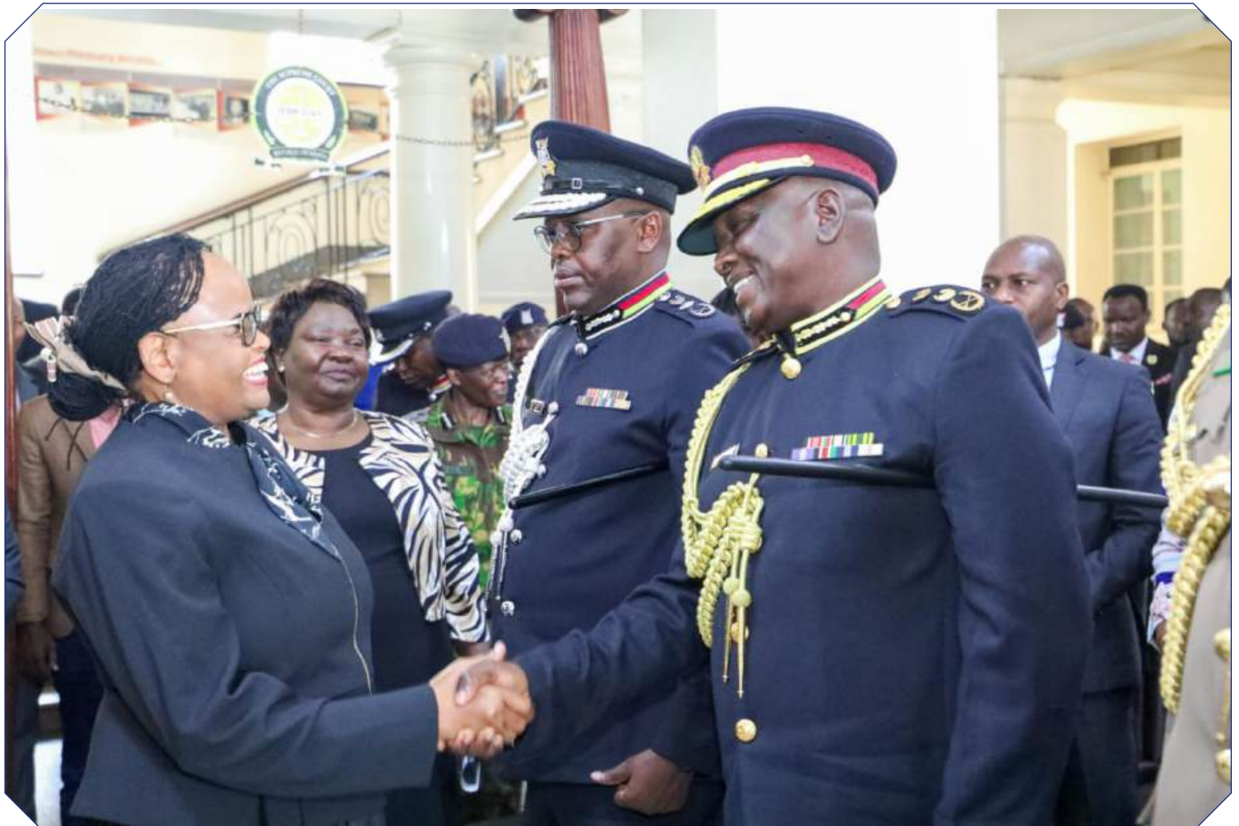
IG Douglas Kanja shakes hands with the Chief Justice and President of the Supreme Court of Kenya Hon. Martha Koome after his swearing in ceremony at the Supreme Court of Kenya on September 19, 2024

service to members of public. Building trust and confidence in the police remains a key pillar as we strive for the highest standards of professionalism and discipline," he said.