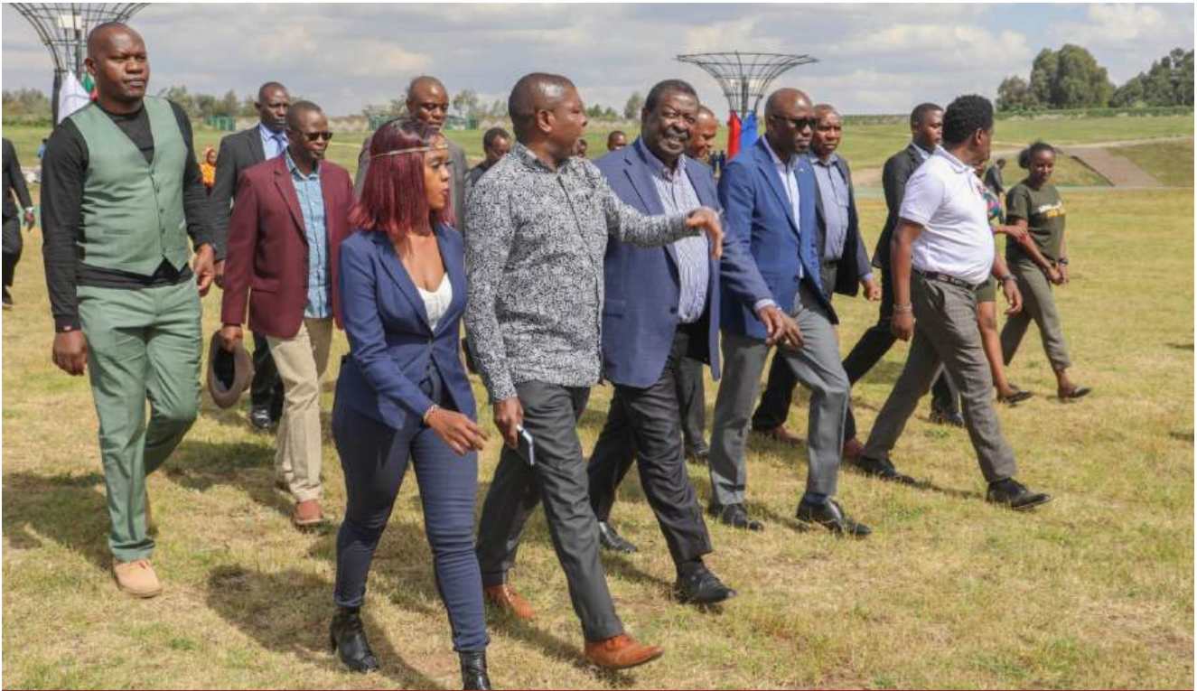
Prime CS and Minister for Foreign & Diaspora Affairs Hon. Musalia Mudavadi arrives at Uhuru Gardens for the Harmony4Haiti concert and Cultural Festival on September 8, 2024

N PS led by Ag. IG Mr. Gilbert Masengeli joined the Ministry of Foreign and Diaspora Affairs in the Harmony4Haiti cultural festival held at the Uhuru Gardens in Nairobi. The event was organized in partnership with Africa4Haiti to enhance Kenya's cultural diplomacy by celebrating and showcasing the rich cultural heritage shared between Africa and Haiti.