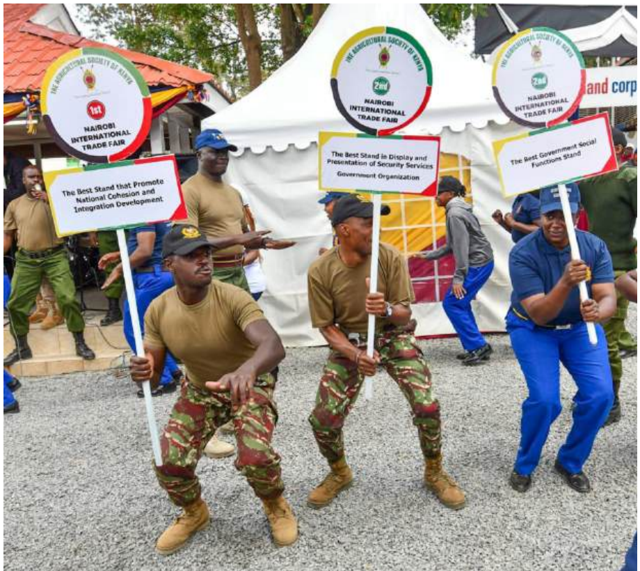
Officers dance in celebration of awards presented to NPS during the Nairobi International Trade Fair