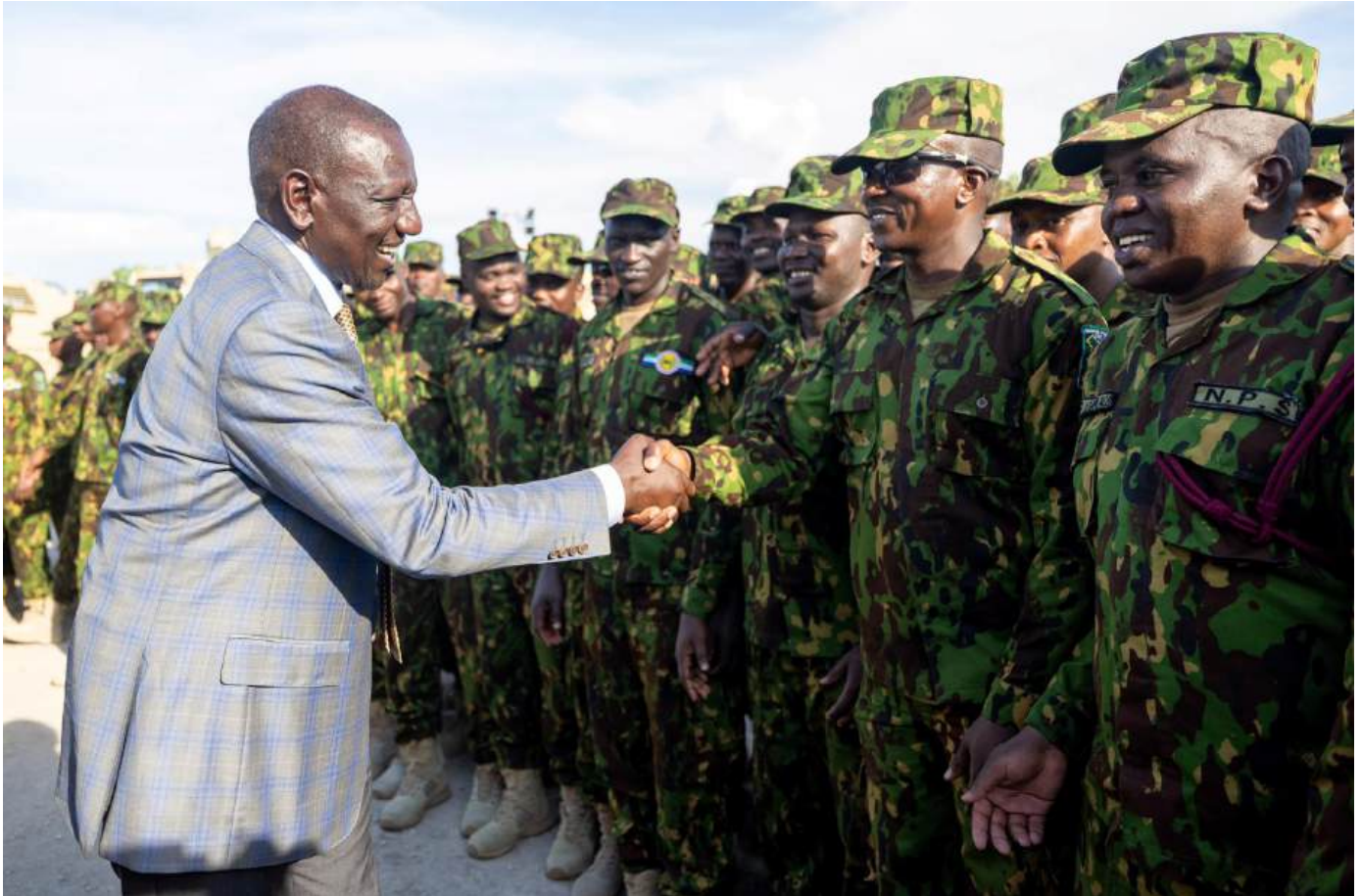
H.E. President William Ruto greets NPS officers deployed for the Multinational Security Support (MSS) mission upon his arrival in Haiti on September 21, 2024

MSS mission: Recognizing the milestones achieved so far