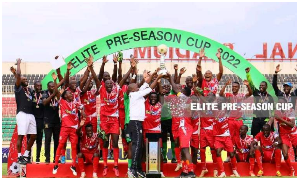
The Kenya Police FC celebrate after winning the Elite Preseason Cup

APS Bomet started as a football team aimed at promoting Community Policing and preaching peace in the region. These efforts bore fruits as Bomet IAAF Stadium which had turned into a hub of criminal activities witnessed a recorded drastic decline in these ill activities as the team started using the facility. The growth of the team also led to more cooperation between the Police and the community. The team was also