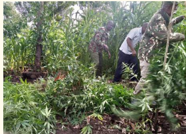
Police officer uproot cannabis sativa in a farm

These efforts have been enhanced by the joint undertakings between the police and other stakeholders in society aimed at eradicating the drug menace. School heads across the country for instance have recently sought the services of police officers in the detection of drugs among students. The police-school partnerships in the prevention of drug abuse