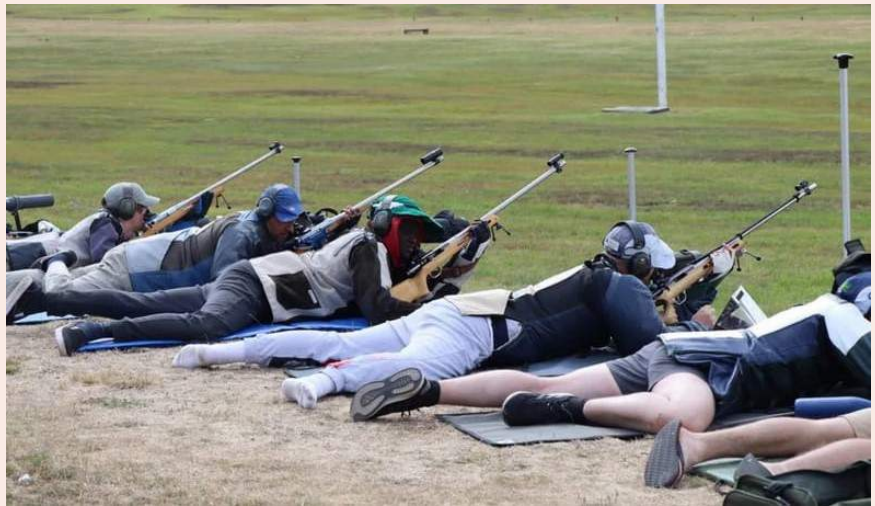
DCI marksmen representing Kenya in Her Majesty the Queen's Platinum Jubilee Imperial meeting which was held at Bisley, United Kingdom

With the impeccable results, the officers showcased their prowess in marksmanship and grasp of various