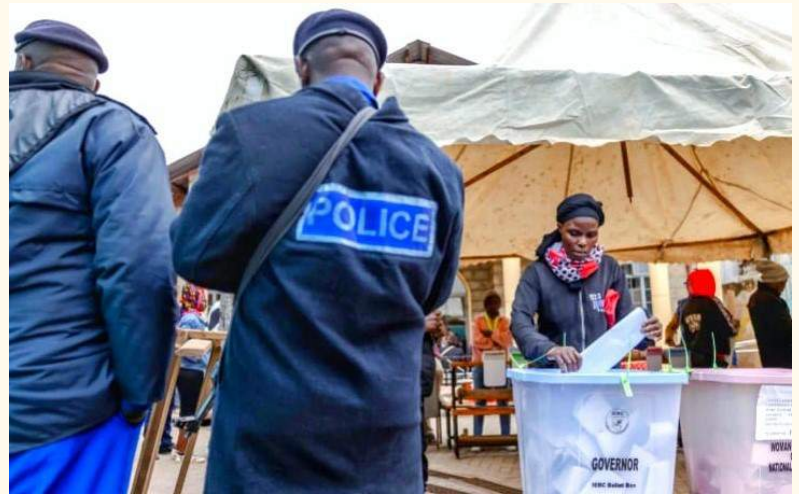
Police officers providing security during the 2022 general elections

as reflected by their professionalism throughout the electioneering period.