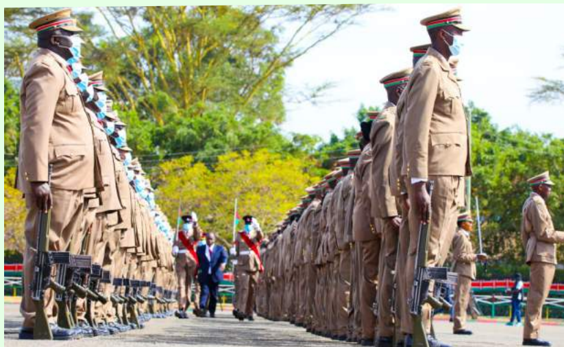
CS Interior Dr. Fred Matiang'i presiding over the passing out parade of the NGAO Officer's at National Police College- Embakasi 'A' Campus

On his part, the PS Interior Dr. Karanja Kibicho, who had