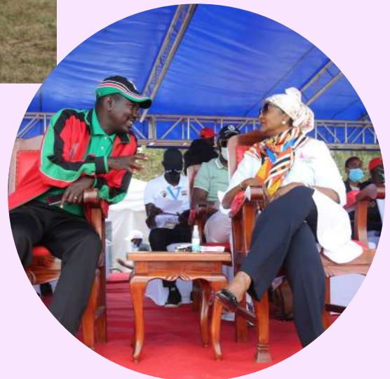
The CS Sports, Culture and Heritage Ambassador Dr. Amina C. Mohamed with Mr. Jackson Mandago Governor of Uasin Gishu County during the event

The National Police Service holds a zero tolerance to all forms of SGBV, and encourages the use of our toll-free number 0800 730 999 by survivors seeking counselling, medical or legal aid.