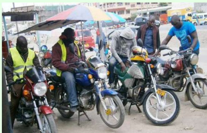
Boda Boda riders wait for clients at a street in Nairobi.

The sector would soon grow, becoming a major employer of the youth. This translated to both positive