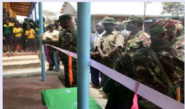
Multi-Agency Security team in Laikipia hands-over newly constructed classrooms at Merigwiti Primary School

intensification of patrols and resettling of affected persons in order to establish sustainable peace and coexistence between communities living in the area. Other interventions include provision of food and non-food items, construction of houses, new roads, classrooms and dams, de-silting and sinking of boreholes, trench digging, establishment of additional security camps, provision of medical and veterinary assistance, courtesy of support provision by KDF. Community peace caravans and school mentorship programs are also conducted. The team has effected multiple recoveries of illegal firearms and stolen