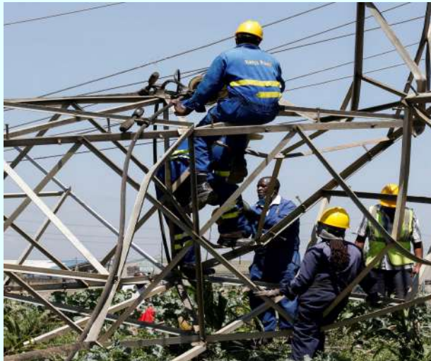
Kenya Power and Lighting Company officers repairing a vandalized pylon.

While speaking at the Kenya School of Government in Kabete, in a meeting attended by the Cabinet Secretary Ministry of Energy Amb. Dr. Monica Juma and the Inspector General of the National Police Service Mr. Hilary Mutyambai, among other senior government officials, the CS emphasized the need to develop and streamline a synergized multi-agency security sector framework that outlines immediate and long-term areas of action in safeguarding the country's energy sector critical infrastructure.