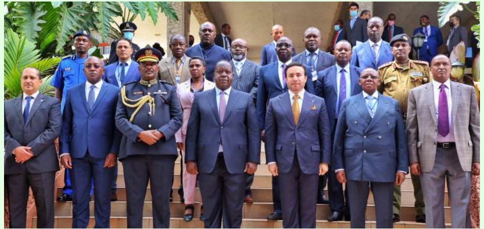
The Cabinet Secretary, Interior Dr. Fred Matiang'i (front row centre) and the IG Mr. Hilary Mutyambai (front row 3rd left) join other dignitaries for a group photograph after the AFRIPOL 10th Steering Committee Meeting'

While giving his opening remarks, the Chief Guest Dr. Fred Matiang'i underscored the essence of partnerships such as AFRIPOL and INTERPOL in pooling resources in order to combat shared security