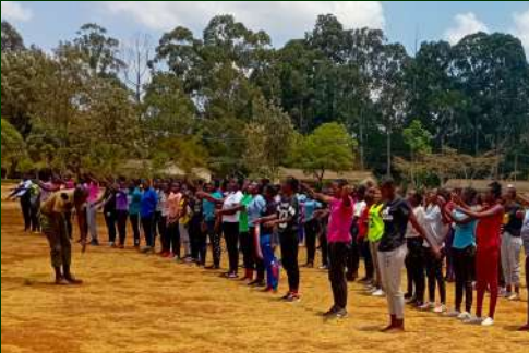
Female candidates warm up during a recruitment exercise

The National Police Service Commission through the Office of the Inspector General on 8 th March 2022 announced their intent to recruit 5,000 police constables. Prior to the recruitment exercise, the Commission conducted pre-recruitment sensitization exercises in various areas to provide information pertaining to the exercise.