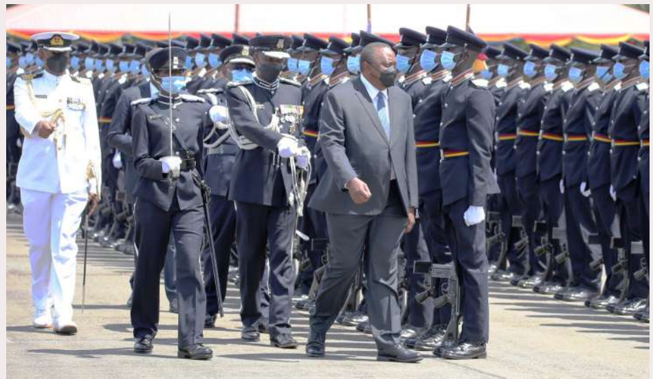
H.E Uhuru Kenyatta, C.G.H, President of the Republic of Kenya and Commander-in-Chief of the Kenya Defence Forces during the pass-out parade of 298 Direct-Entry Inspectorate officers