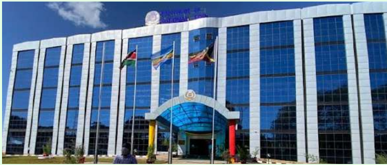
National Police Forensic Laboratory