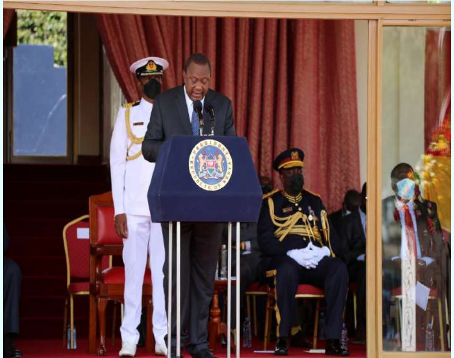
H.E Uhuru Kenyatta, C.G.H, President of the Republic of Kenya and Commander-in-Chief of the Kenya Defence Forces gives his speech during the pass-out parade of 298 Direct-Entry Inspectorate officers at the National Police College, Kiganjo in Nyeri County

The President directed continued enforcement of the moratorium until adequate measures to effectively regulate the scrap metal trade including proper mechanisms of disposal and sourcing are effected. While referring to vandalism of electricity transmission infrastructure, the standard gauge railway and communication masts, the President emphasized that such activities were acts of economic sabotage to the development of our nation.