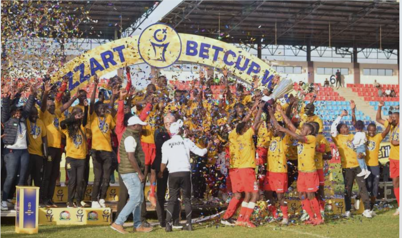
Kenya Police FC celebrate after winning the Mozzart Betcup title after beating Kenya Commercial Bank in post match penalties