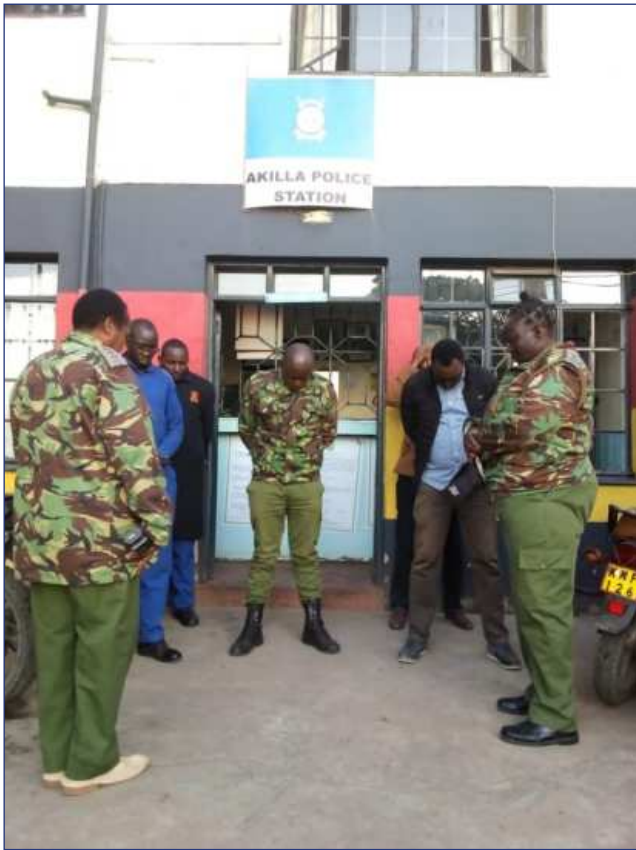
Akila Police Station Officers bow down for prayer before departing for their work on July 8, 2024