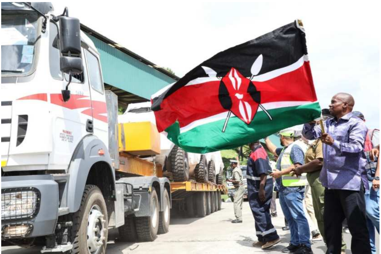
CS Interior Prof. Kithure Kindiki receives a consignment of Armoured Personnel Carriers in Mombasa County on May 14, 2024