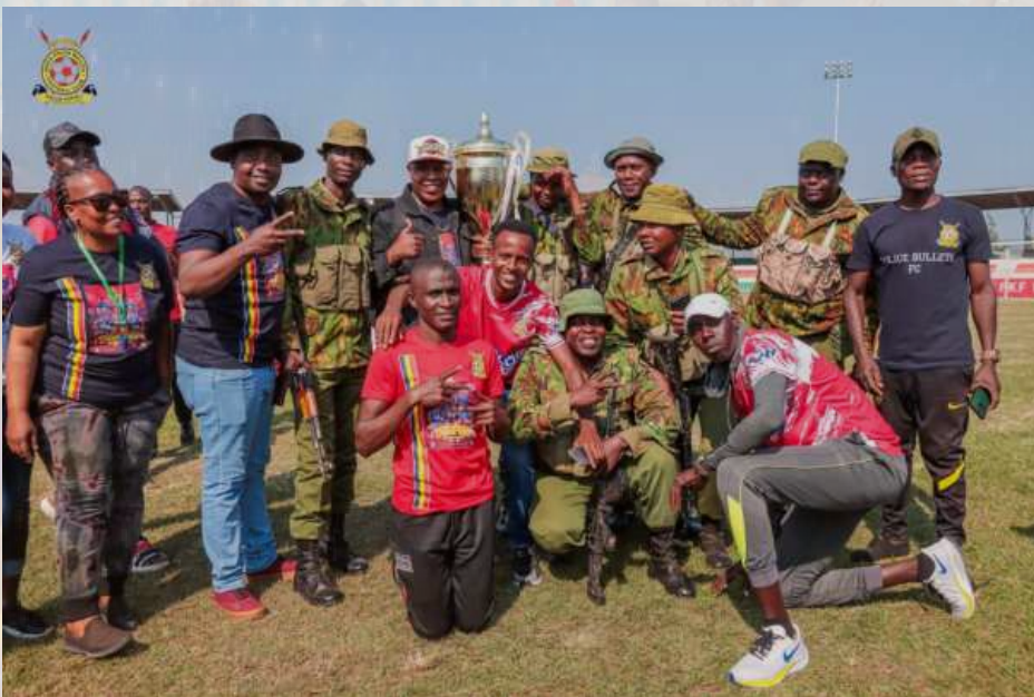
Fans celebrate Police FC Mozzart Bet Cup Title win 2024

With the 2024/2025 football season in the offing, we wish the best to the teams as they gear up their preparations.