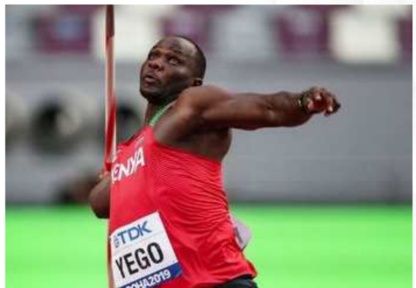
Senior Sergeant Julius Yego African record holder in javelin throw

Our officers go to this year's Olympics having achieved various feats in the ongoing athletics calendar. PC Beatrice Chebet who will be making her debut in the showpiece is the reigning world record holder in the 10,000 meters, with a time of 28:54.14, Corporal Ferdinand