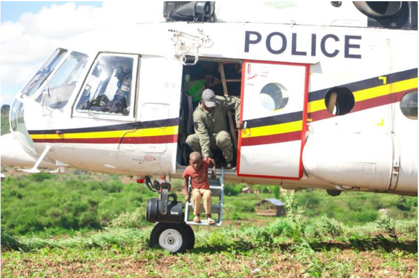
Five-year-old Mutuku Kioko is rescued from flood waters by a team from NPS Airwing at Nduati in Yatta, Machakos County on April 23, 2024