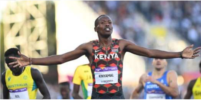
CPL Wycliffe Kinyamal men's 800m gold medalist at the Birmingham Commonwealth Games

his preparations with a win in the men's 100m at the FBK Hengelo Games in the Netherlands. Wycliffe Kinyamal hopes to impress in 800m similar replicating his Gold-winning performance at the last edition of Commonwealth Games. Meanwhile, our very own Julius Yego is the African record holder in the Javelin throw.