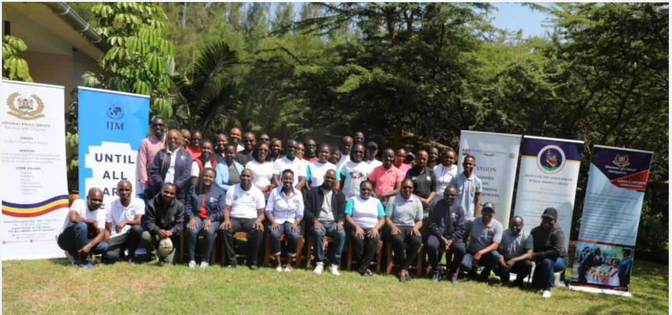
Participants take a group photo during the Inter agency Comms wellness workshop at Chaka Ranch, Nyeri County

On the 14th and 15th of June 2024, communication teams representing various Criminal Justice System (CJS) actors converged at Chaka Ranch in Nyeri County for a two-day workshop. The workshop was geared to promote cooperation among the communication teams and to explore the various areas of partnerships among the teams.