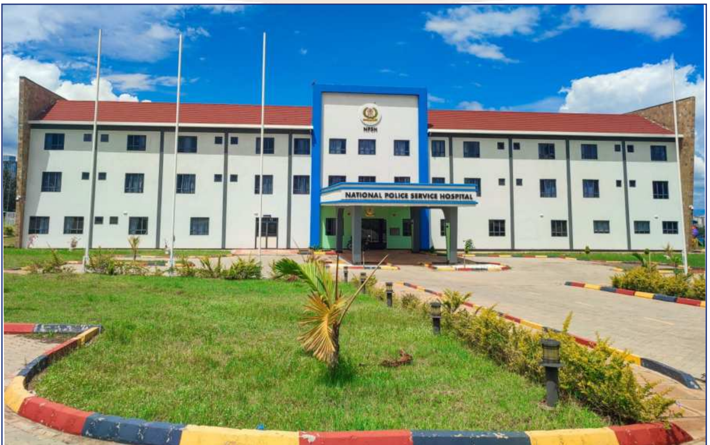
The National Police Service Level IV Hospital in Mbagathi, Nairobi County

The availability of these facilities has been crucial in enhancing the accessibility of health services, hence transforming the country's health sector for enhanced service delivery to attain Universal Health Coverage (UHC).