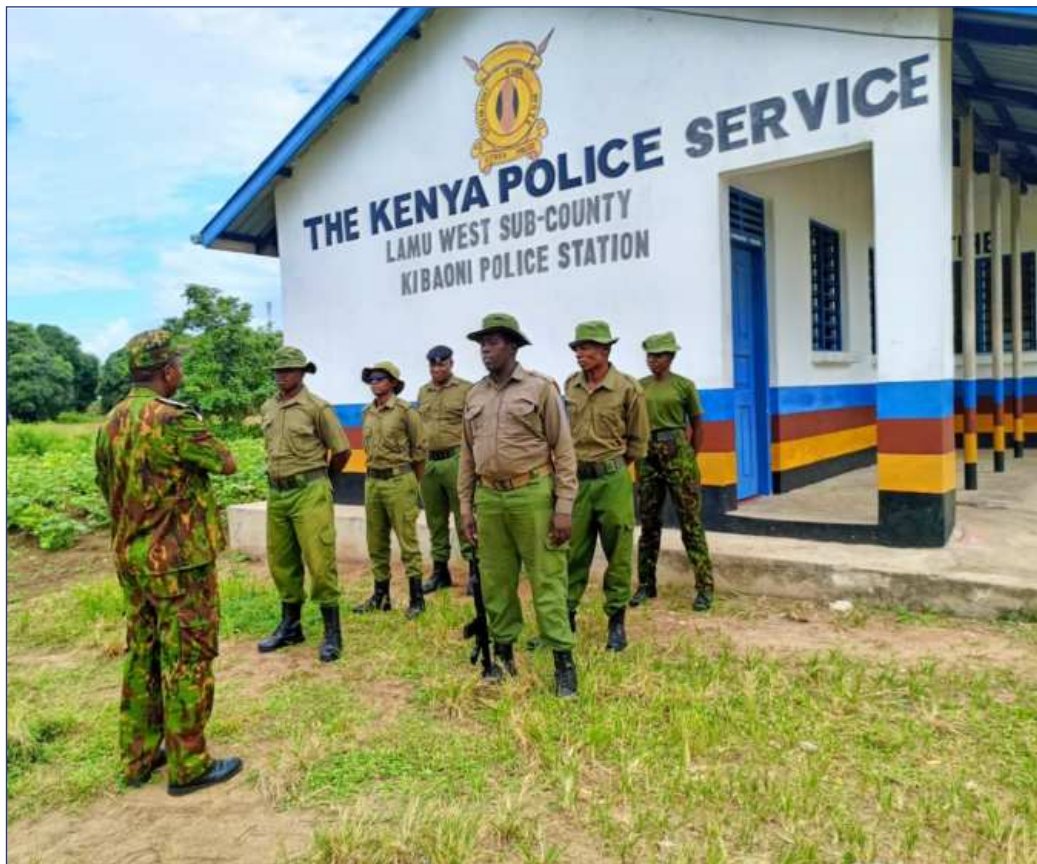
Police Officers at Kibaoni Police Station during a routine daily brief before being dispatched to their areas of responsibility