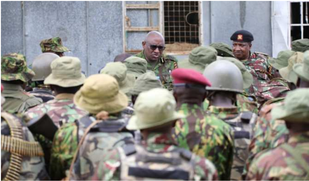
IG Japhet Koome speaks to officers during his security assessment tour of Baringo and Elgeyo Marakwet Counties in April

Inspector General of Police, IG Japhet Koome continued with security assessment of the North Rift, particularly Baringo County. At the height of the resurgence of cases of cattle rustling and banditry in Isiolo and Meru Counties, IG Koome took several security tours where he actively engaged local leaders, security officers and members of the community on various security-related matters.