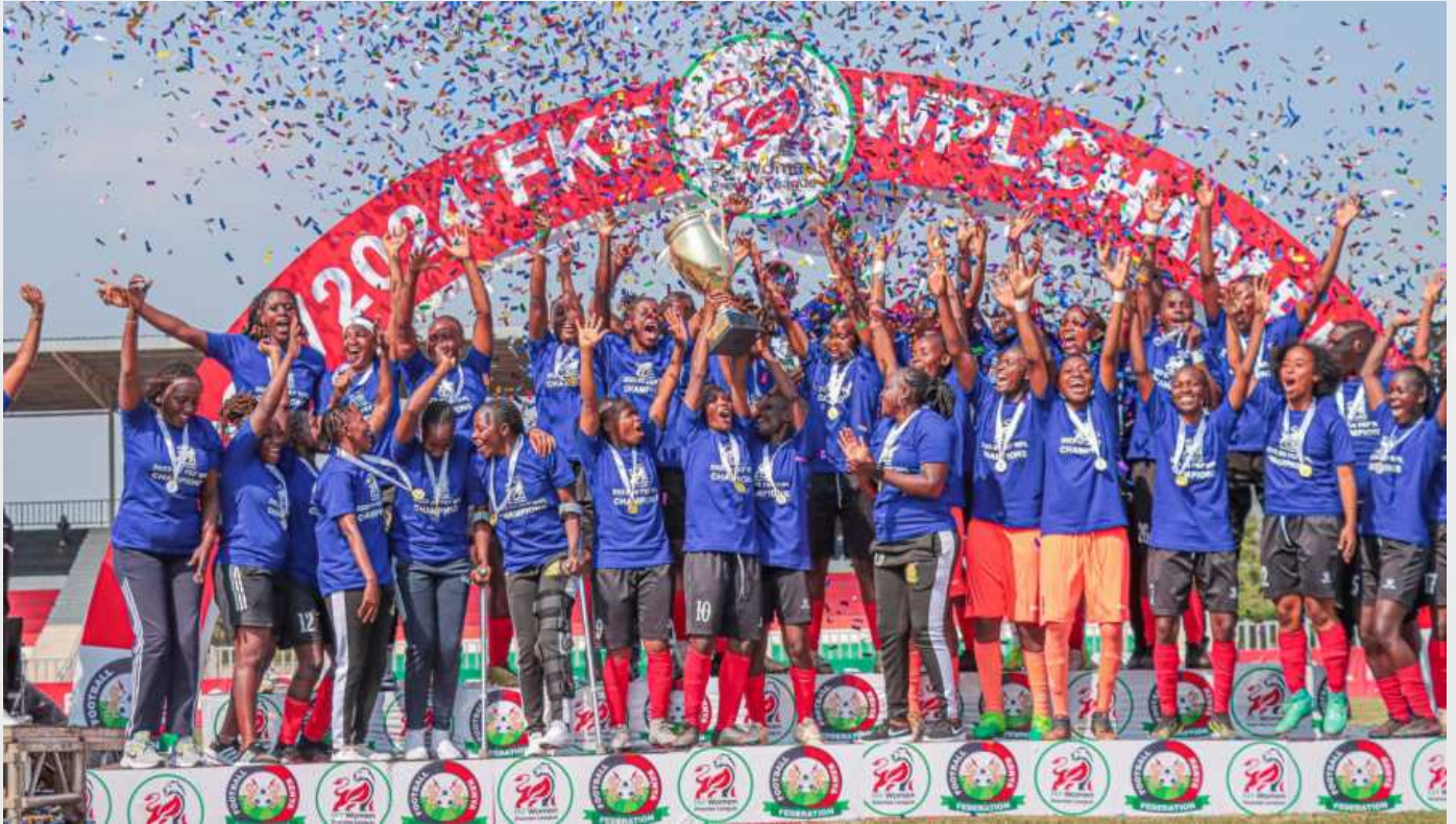
Kenya Police Bullets celebrate after being crowned the 2023/2024 FKF Women Premier League Champions

F ifteen wins, four draws, Zero losses, and a record 49 points. These are the stats amassed by the reigning 2023/2024 Football Kenya Federation (FKF) Women's Premier League champions - Kenya Police Bullets FC. The bullets spiraled to the summit of the elite women's league in the country deservedly ahead of close rivals Ulinzi Starlets and Vihiga Queens.