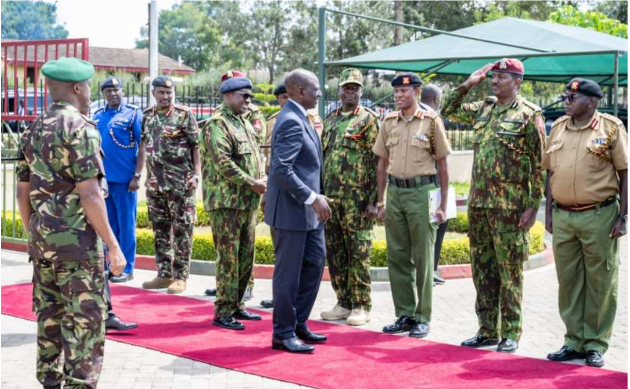
H.E President William Samoei Ruto, PhD greets senior NPS Officers at the National Police College Embakasi 'A' Campus during the flagging off of the first Contingent of NPS Officers to the Haiti Mission on June 24, 2024