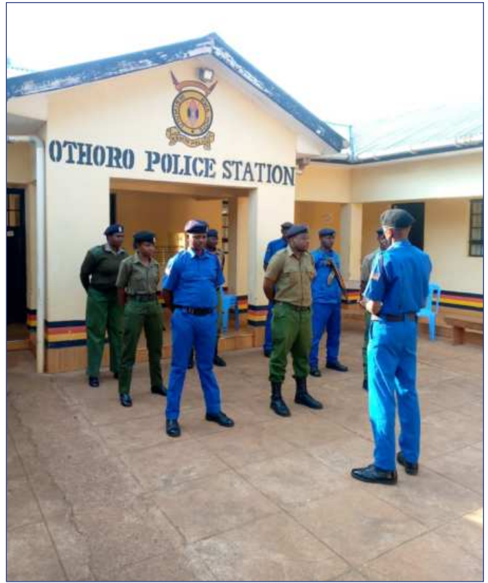
Police Officers being briefed on dress regulations at Othoro Police Station in Homabay County on June 8, 2024