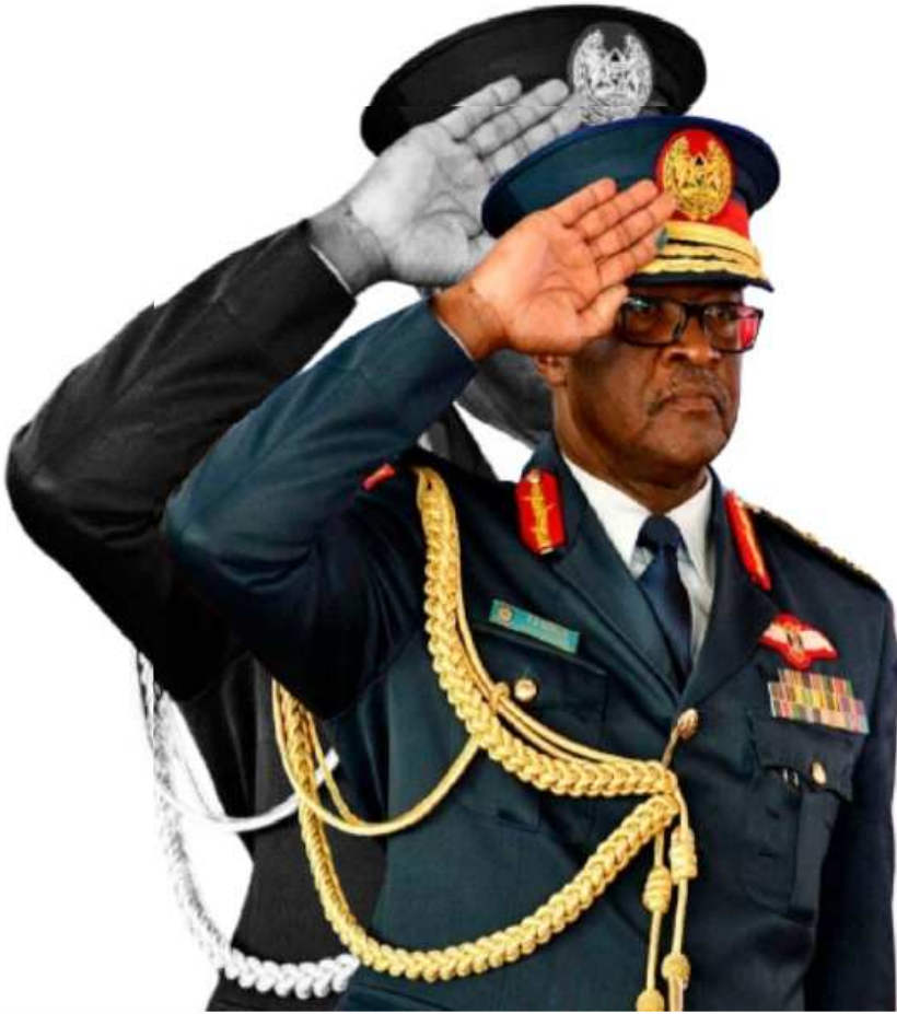
The Late Chief of Defence Forces Gen. Francis Omondi Ogolla, EGH, EBS, HSC, 'ndc'(K) 'psc' (FRA)

In a true spirit of multi-agency cooperation between the National Police Service and Kenya Defence Forces, the late Gen. Ogolla and Inspector General National Police Service Japhet Koome toured the troubled North Rift Region. While visiting the troops, they reiterated the commitment and dedication by the multi-agency security teams to restore peace and normalcy in the affected counties whilst underscoring the importance of cooperation between security agencies and local communities.