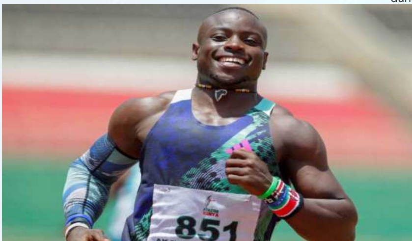
CPL Ferdinand Omanyala the African record holder for 100m sprint

officers has been undisputed. This comes in the backdrop of various cases of doping reported across the globe. Remarkably, our officers have been cleared to participate in various races both locally and globally. In addition, they have been dedicated ambassadors in supporting the running 'clean' campaign void of any doping malpractices.