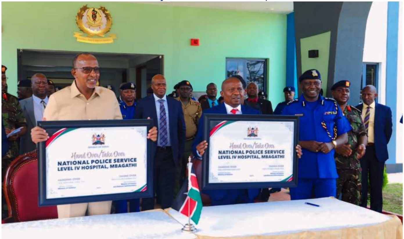
CS Defence Hon. Aden Duale and CS Interior Prof. Kithure Kindiki, during the handing over ceremony of NPS Level 4 Hospital from the military to the National Police Service on May 17, 2024

The CS for Defence Hon. Aden Duale and the CS for Interior and National Administration Prof. Kithure Kindiki on 17th May presided over the handing/taking over ceremony of NPS Level 4 Hospital from the military to the National Police Service. It was the culmination of a journey towards the construction of a police-affiliated hospital, an idea that was mooted over 20 years ago and realized when construction began in 2021.