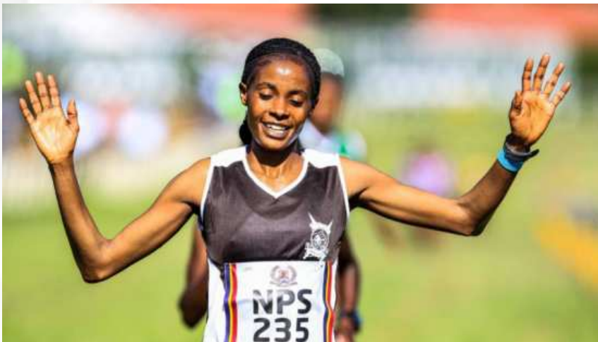
PC Beatrice Chepkoech 3000m Steeplechase Silver medalist in Gold Coast, Australia