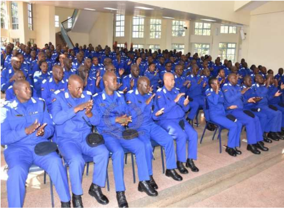
Chief Inspectors applaud a speaker during the opening of HTC course at National Police College, Main Campus - Kiganjo

In tandem with the Constitution of Kenya 2010, NPS strives to improve the professionalism and training of its Officers to the highest standards. In so doing, the Service supports continuous training to ensure that Officers are adequately prepared to respond to the rapidly evolving nature of crime. Such training including the promotional and capacity building courses at knowledge and skills necessary to identify, and respond effectively to security threats, emergencies and other critical incidents.