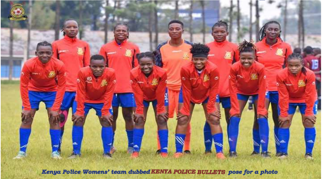
Kenya Police Womens' team dubbed KENYA POLICE BULLETS pose for a photo

The 2023/2024 Football Kenya Federation (FKF) Women Premier League enters the home stretch, in what has been an entertaining and highly competitive season, Kenya Police Bullets FC now leads the table standings having accumulated 43 points with 17 games already played. This is a result of the remarkable results that the team has registered in the course of the season. It is only less than a year since the women's team was acquired by their male counterparts Police FC in fulfillment of the Confederation of African Football (CAF) mandate of male football clubs having a female team.