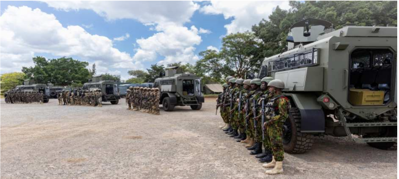
Officers showcase some of the newly acquired armoured vehicles and weapons during the commissioning held at the GSU Headquarters in Ruaraka on 20th March 2024