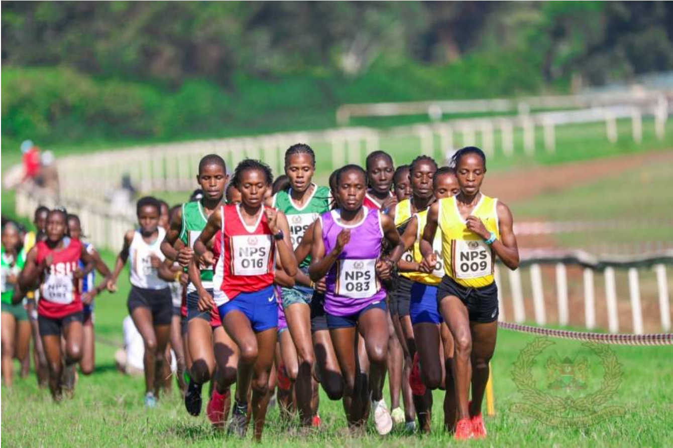
Ladies team during the 12th edition of the NPS cross-country championship at Ngong' Race Course on January 19, 2024