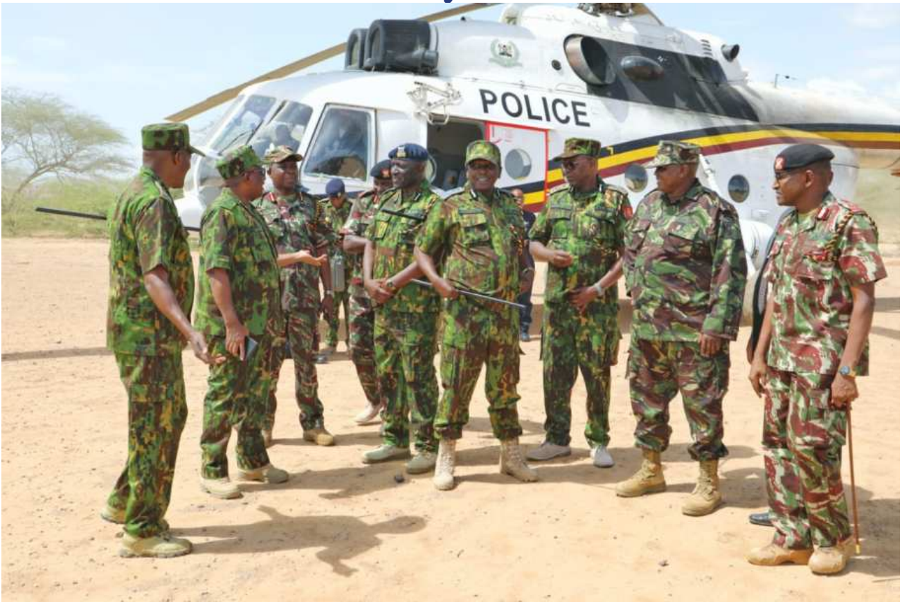
IG Japhet Koome leads a contingent of NPS senior officers for a multi-agency tour of Baringo County on March 5, 2024

In January 2024, the Inspector General of Police, IG Japhet Koome together with the Chief of Defence Forces General Francis Ogolla took a security assessment visit to Tiaty, Baringo County where they met with Officers in the frontline in the ongoing multi-agency Operation Maliza Uhalifu in North Rift and the locals who gave insight into the security situation in the area.