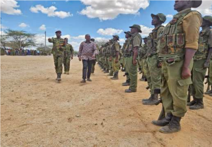
CS Interior Prof. Kithure Kindiki presides over a pass out parade for National Police Reservists in Isiolo County

A cohort of 136 NPRs in Isiolo and another of 140 in Laisamis Marsabit County completed their training on 14 th March. The culmination of their training was marked by separate events, both which were presided over by the Cabinet Secretary, Ministry of Interior and National Administration Prof. Kithure Kindiki.