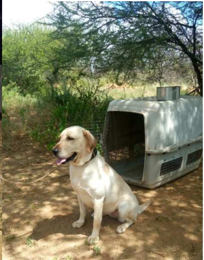
K-9 Cindy uncovers a consignment of suspected narcotic drugs during an operation at Archers post, Samburu County

If you have gone through security checks at vital installations, border or travel hubs like the Standard Gauge Railway (SGR) Stations, then you have likely encountered the NPS K9 Unit. It is a specialized unit mandated to offer policing services and other support services using Police Dogs.