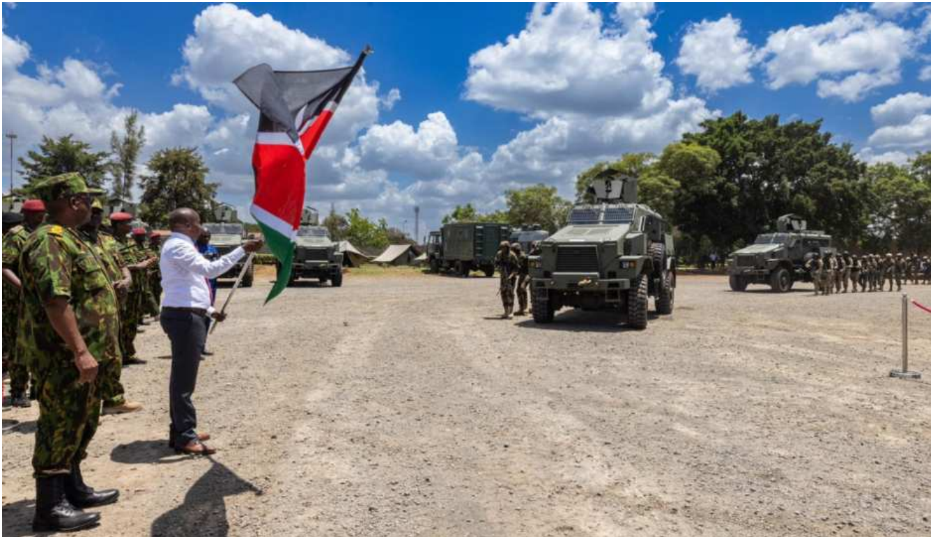
CS Interior Prof. Kithure Kindiki flanked by IG Japhet Koome, flags off the newly-acquired modern security equipment at GSU Headquarters, Ruaraka on March 20, 2024