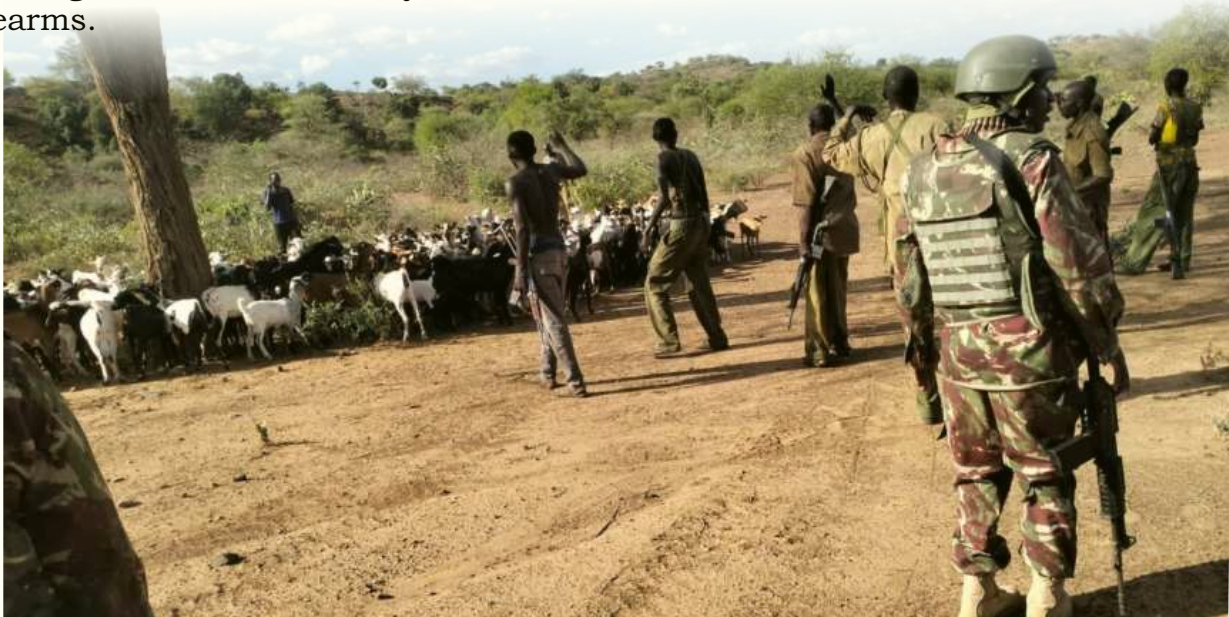
Multi-agency teams under operation Maliza Uhalifu successfully recover livestock stolen by bandits at Kapkomon village, Baringo County on March 21, 2024

Since its inception in February 2023, OMU has recorded significant gains against the banditry menace with the restoration of normalcy, reopening and resumption of learning in schools, recovery of over 11, 000 stolen livestock and over 100 illegal firearms.