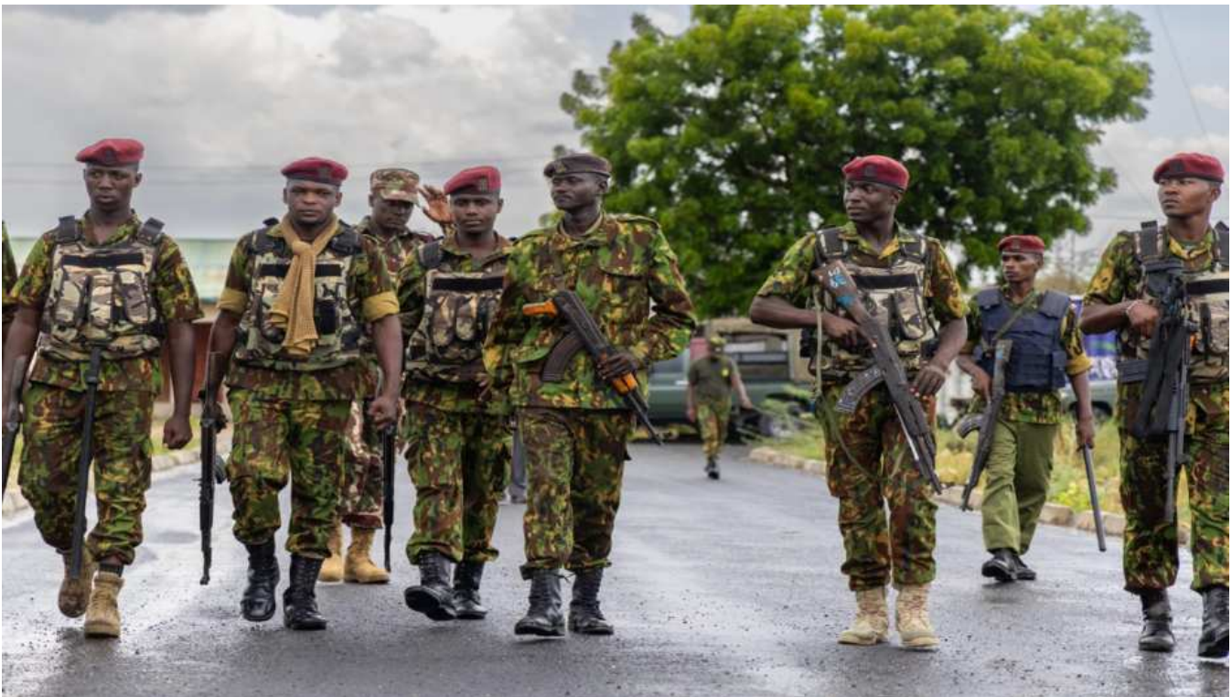
NPS officers on a patrol during a county security appraisal forum in Garsen, Tana River County