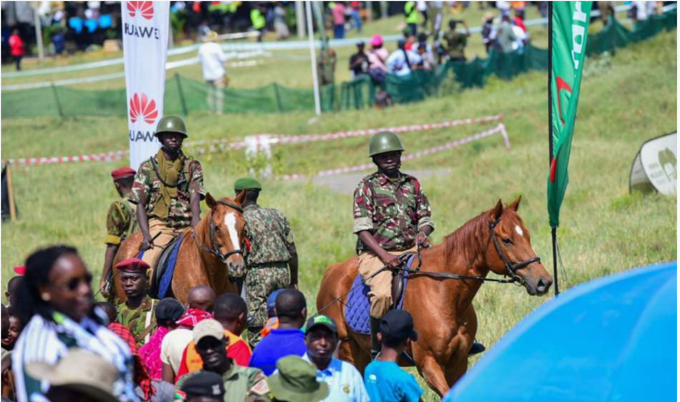
A contingent of ASTU officers on horseback flanked by GSU and other multi-agency officers control excited crowd during the WRC 2024 in Naivasha