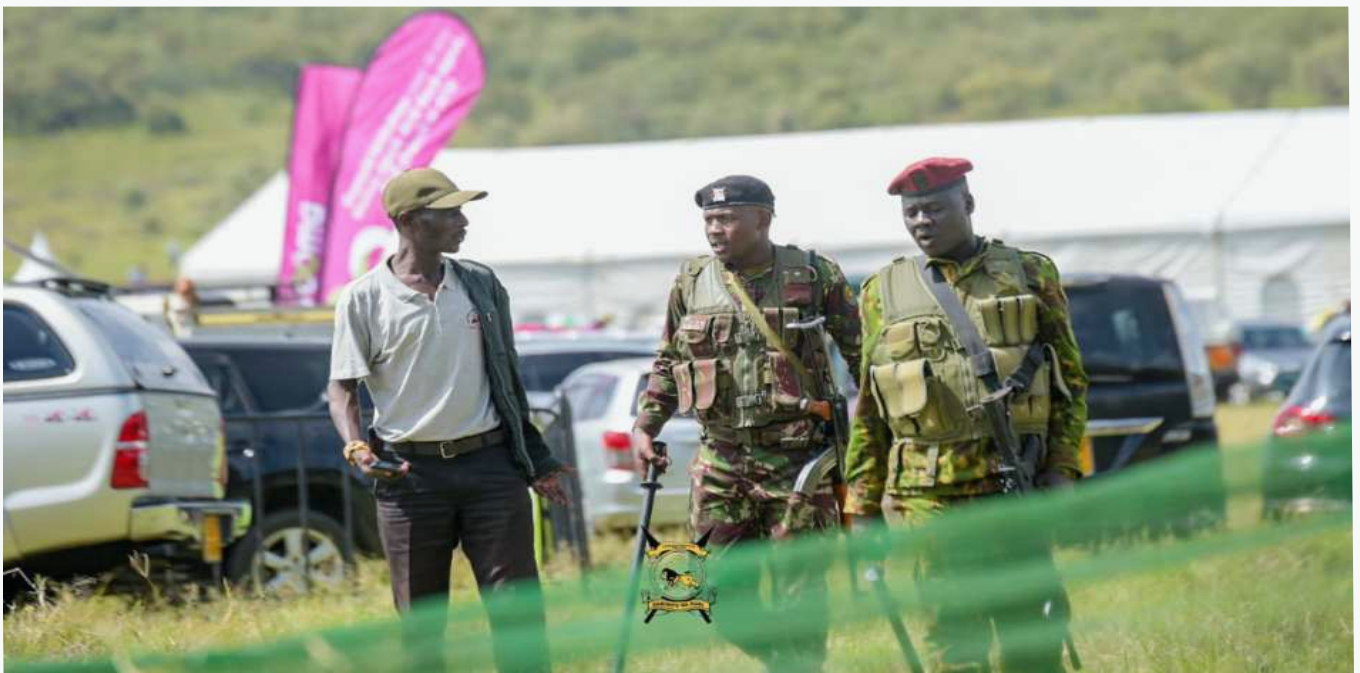
NPS officers on ground patrol at the WRC service station