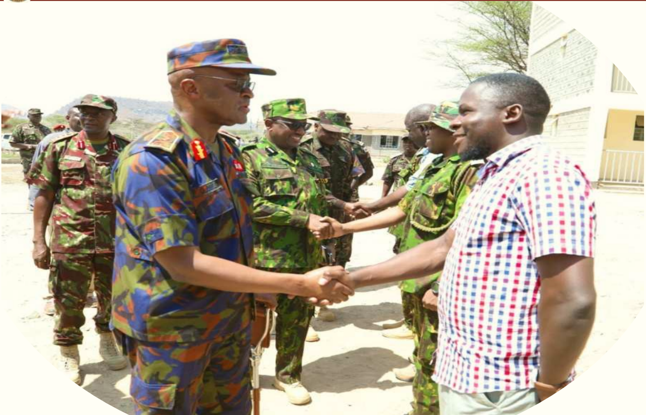
IG Japhet Koome together with the Chief of Defence Forces Gen. Francis Ogolla meets multi-agency officers' under operation Maliza Uhalifu at Chemolingot during a tour of Baringo County