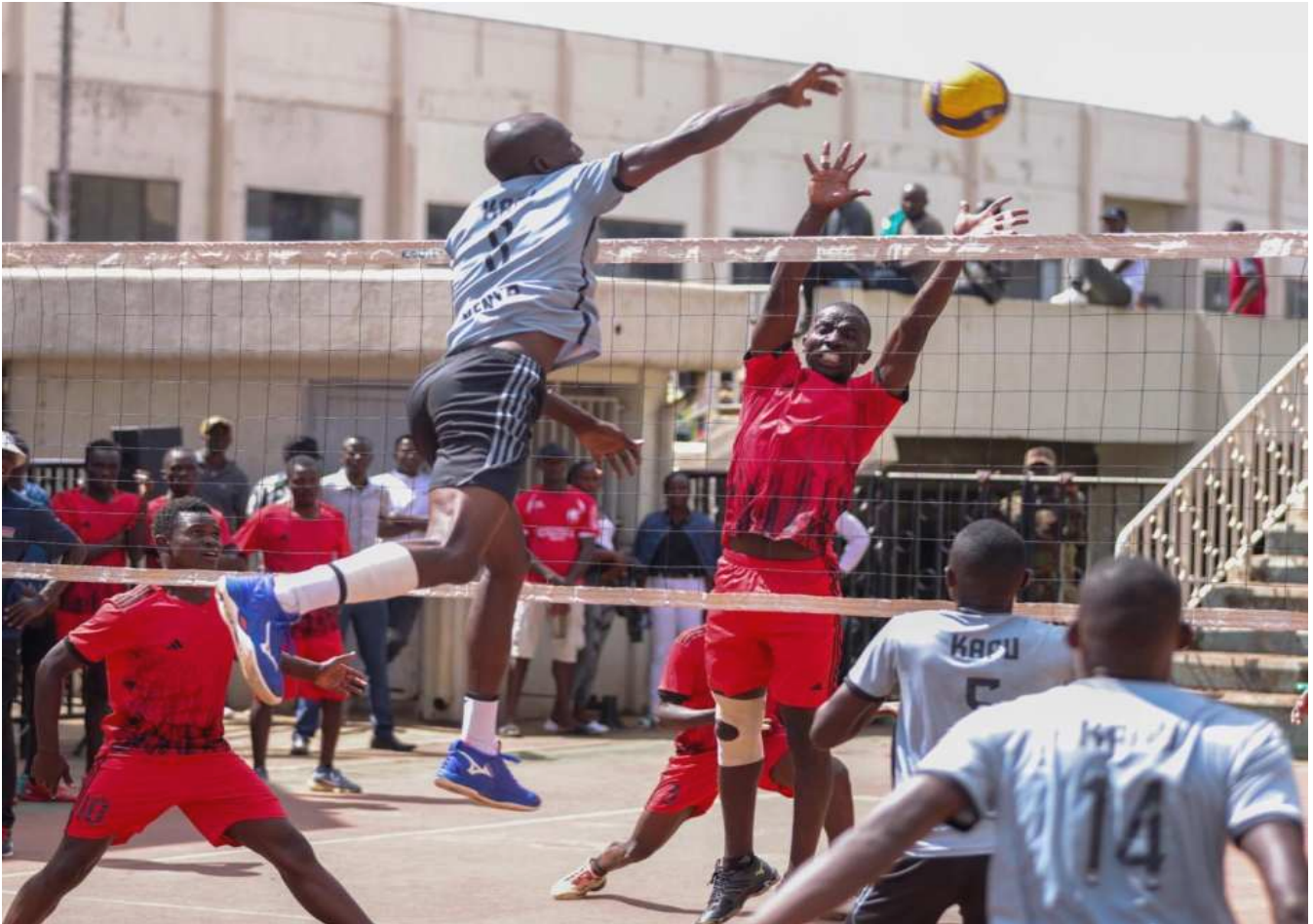
A KAPU player spikes past the opponent during a tournament match

However, their journey has not been without setbacks. The team has no sponsorship deals and faces financial challenges but has withstood these challenges with support from KAPU officers.