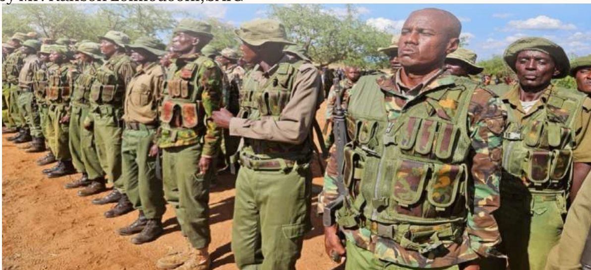
A cohort of National Police Reservist during a pass out parade in Burat, Isiolo County

The training and deployment of NPRs has particularly been an effective strategy in enhancing security in the six Counties that have been declared "Dangerous and Disturbed" due to the banditry menace. Reservists are usually recruited from the local communities because they have a better knowledge of the terrain and modus operandi of the bandits.