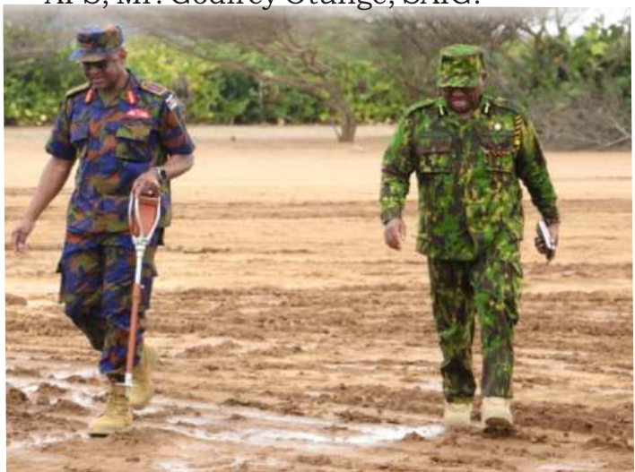
The Chief of Defence Forces Gen. Francis Ogolla together with IG Japhet Koome on a ground tour of Baringo County in January 2024