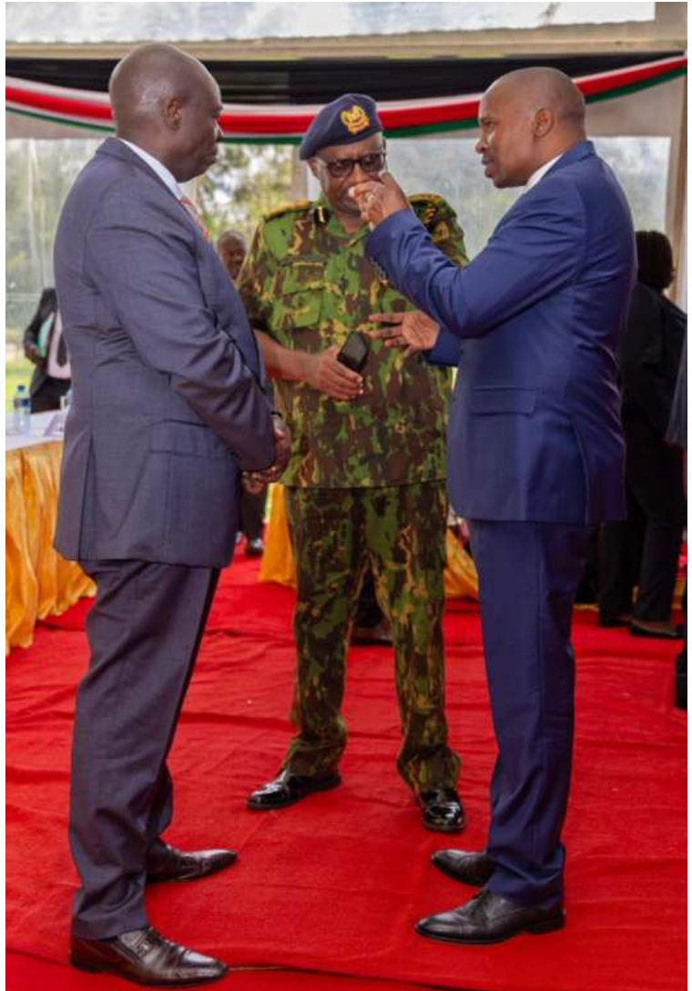
His Excellency Rigathi Gachagua, EGH Deputy President of Kenya converses with CS Interior Prof. Kithure Kindiki and IG Japhet Koome during a consultative meeting held at the Deputy President's official residence in Karen, Nairobi

NPS working jointly with INTERPOL in the fight against drug trafficking. In March, Officers at the Jomo Kenyatta International Airport intercepted a consignment of suspected cocaine destined for Madagascar, after a lady was found in possession of the drug at Terminal 1A.