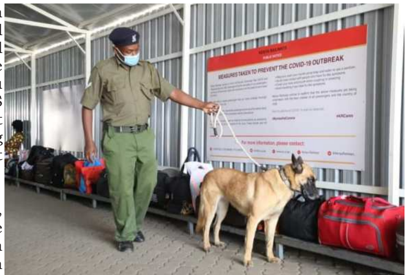
A K-9 Unit officer walks an explosive sniffer dog as it inspects luggage at the SGR Syokimau Terminus

The unit was started on October 5, 1948 at Nanyuki, under the Criminal Investigation Department (CID). It was then relocated to Nairobi Central Police, then known as Kingsway, and later moved to army kennels near Kenyatta National Hospital. On October 2, 1980 the Dog Section moved to the current location Lang'ata.