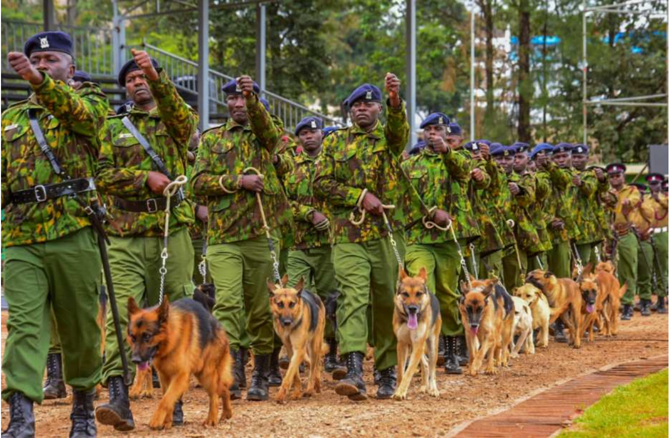
Officers from the K-9 Unit march past during a national celebration ceremony

In January this year, police dogs (fondly referred to as POLDOGS per police jargon) aided the recovery of a consignment of suspected narcotics in Samburu County, leading to the arrest of three suspects found trafficking 196 kilograms of narcotics valued at Ksh. 5.8 million. The illegal substance was discovered by POLDOG Cindy concealed beneath sacks of beans in a trailer. Three Ethiopian aliens were also found hidden in the trailer.