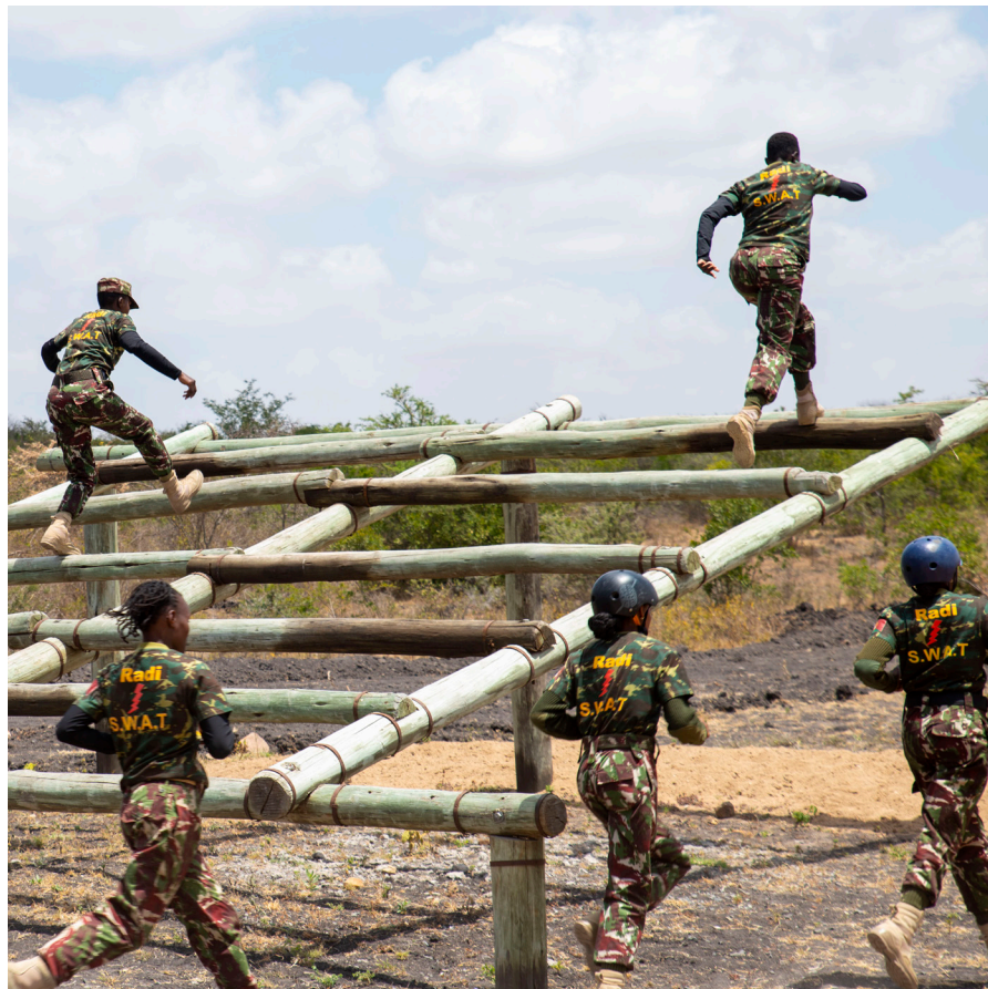
Special Weapons and Tactics (SWAT) Officers during a training session at Kanyonyo