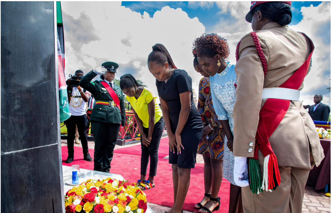
Widows of the Fallen Heroes bow after laying a wreath at the monument during the 5th Joint Commemorative Service held on 14th December, 2023