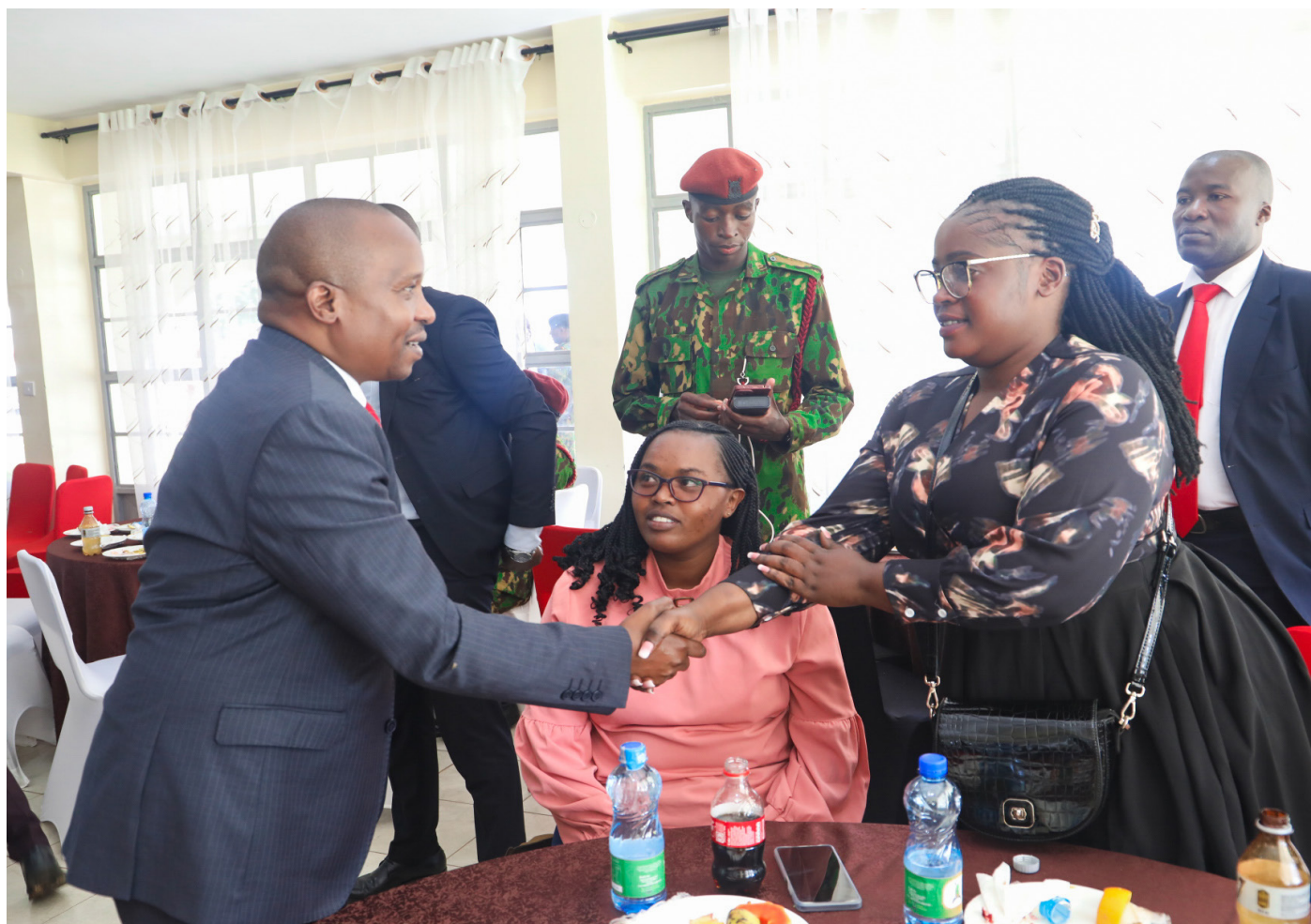
Interior CS Prof. Kithure Kindiki meets widows of the fallen heroes at a luncheon after the commemorative Service held at Embakasi 'A' Campus

The National Police Service acknowledges the remarkable bravery of our Fallen Heroes. They each gave, as Abraham Lincoln said, the “last full measure of devotion” to our beloved country.