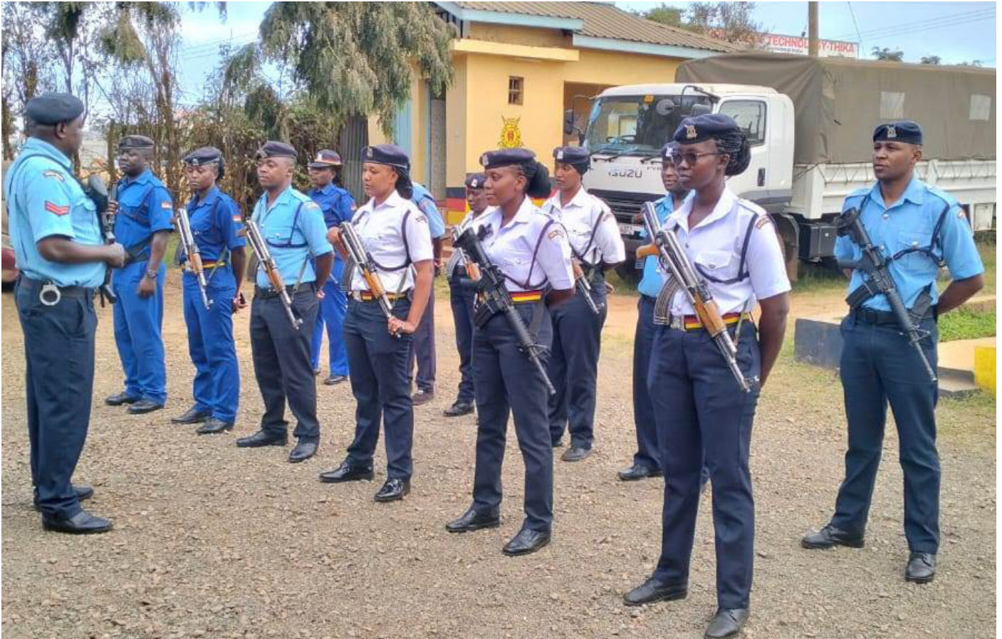
Kenya Police Service Officers during a morning Tamaam Parade at Makongeni Police Station in Thika West Sub- County