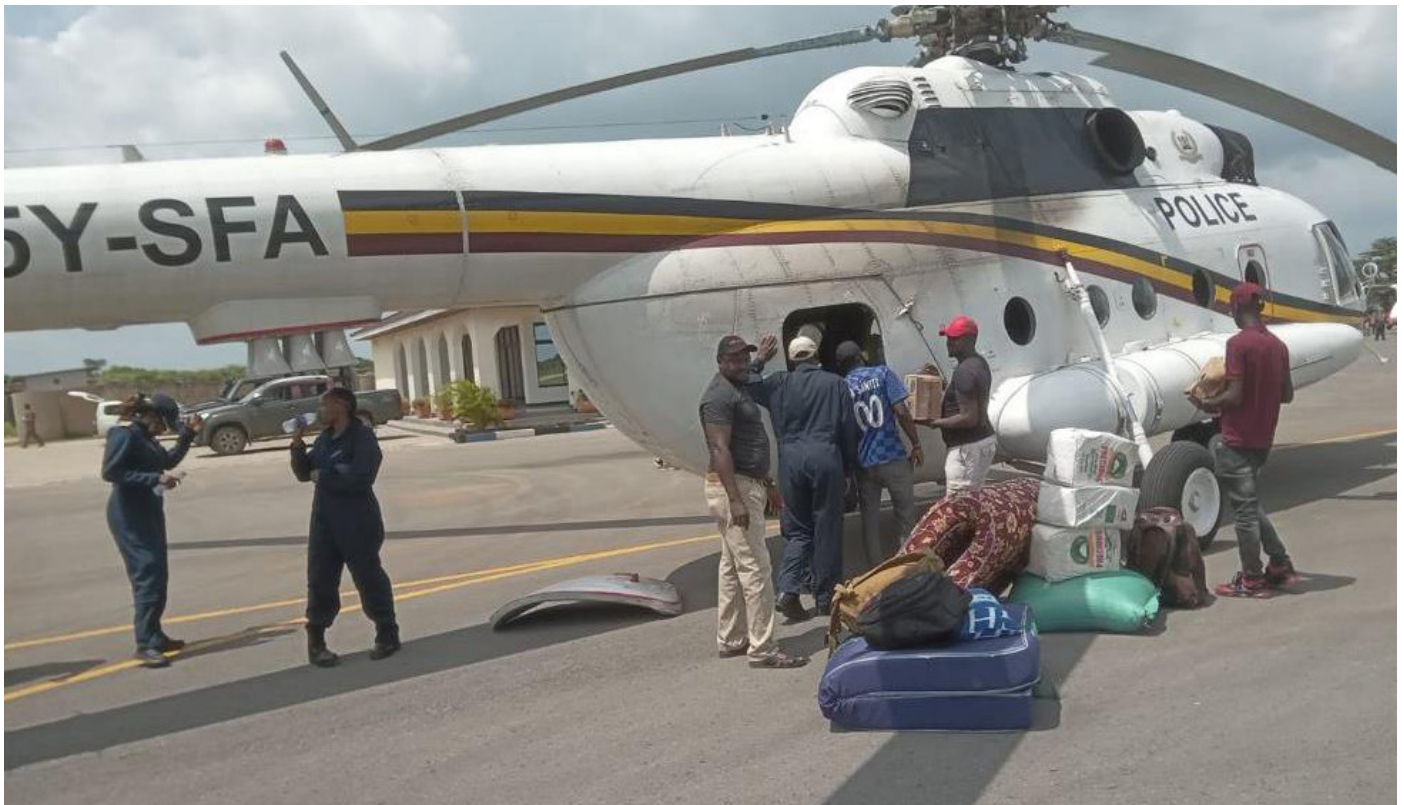
NPS Airwing Officers distribute aid and evacuate those affected by floods in Lamu County

As many parts of the country experienced heavy flooding due to the torrential downpours caused by the El Nino phenomena, NPS Airwing came in handy in providing emergency assistance to the affected populace. Among the most affected areas were parts of North Eastern