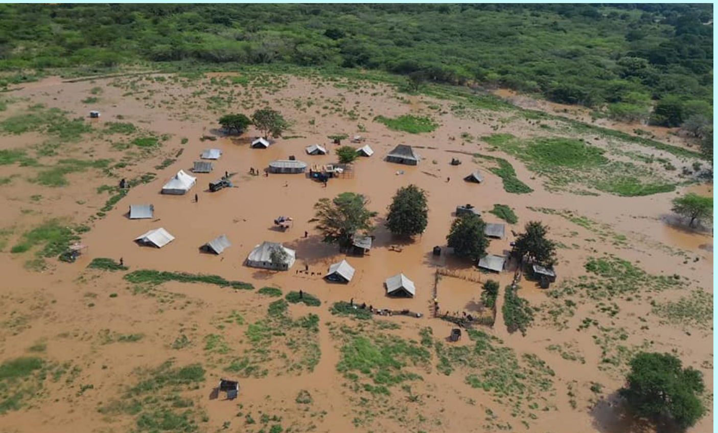
Wema General Service Unit (GSU) Camp in Tana River County submerged by flood waters