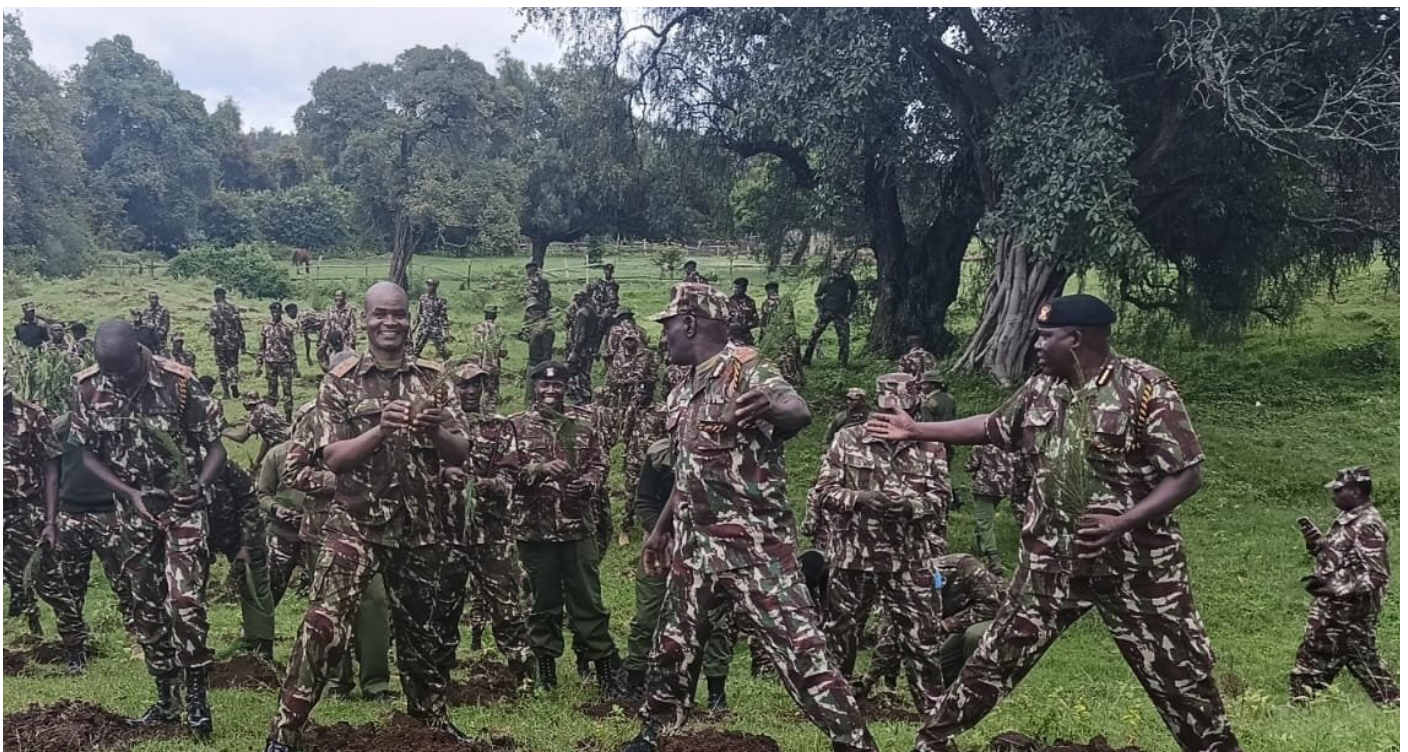
Anti Stock Theft Unit (ASTU) Police Officers during a tree planting exercise held at ASTU Headquarters, Gilgil on the National Tree Planting Day Nov 13, 2023

T he late Prof. Wangari Maathai, founder of the Green Belt Movement and the 2004 Nobel Peace Prize Laureate once stated that "When we plant trees, we plant the seeds of peace and seeds of hope." In heeding to the government's nationwide drive to plant 15 billion trees by 2032, National Police Service officers from the Services, Directorates, Units, and Formations observed the maiden National Tree Planting Day on November 13, 2023 by planting trees.