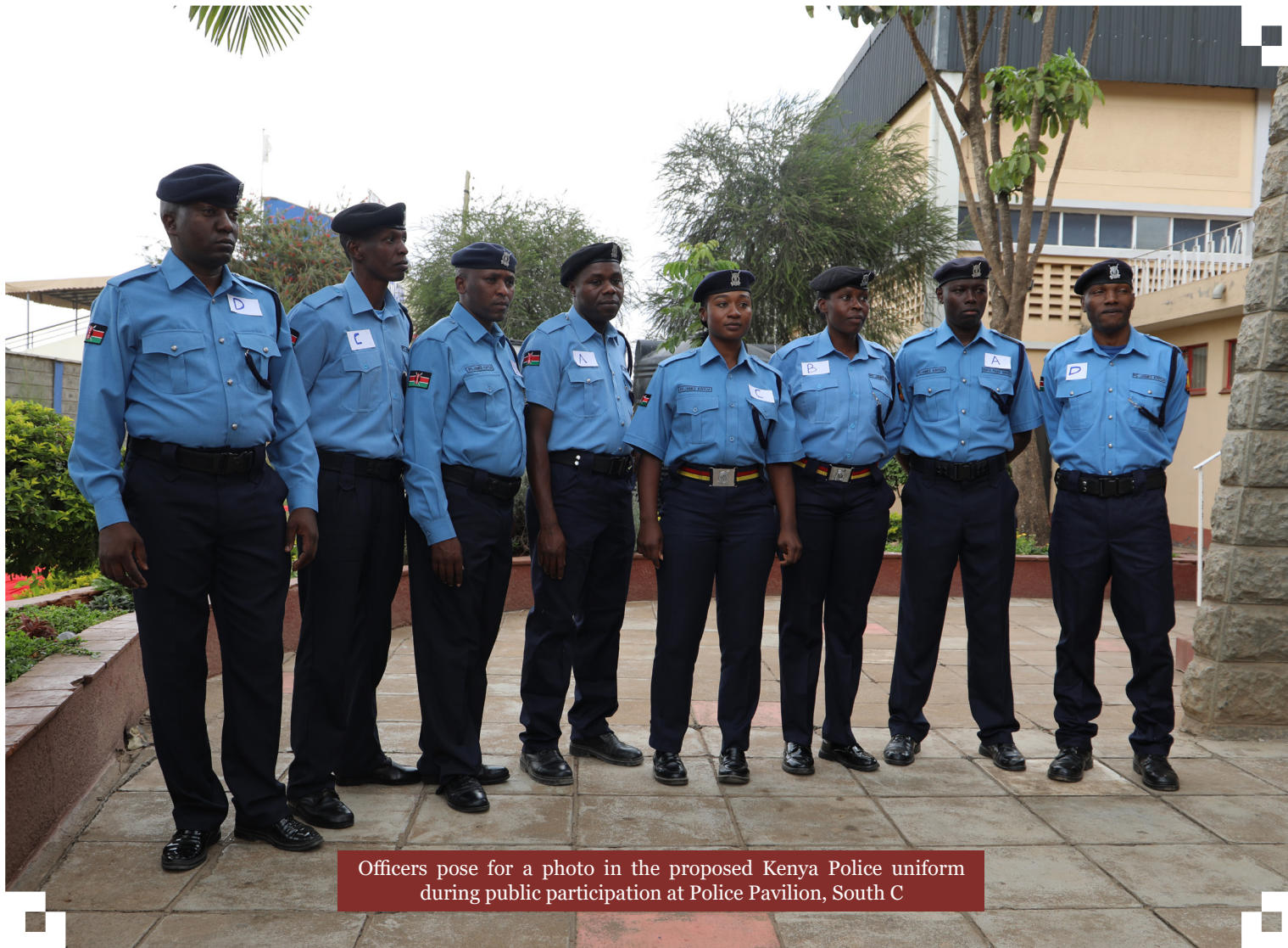
Officers pose for a photo in the proposed Kenya Police uniform during public participation at Police Pavilion, South C