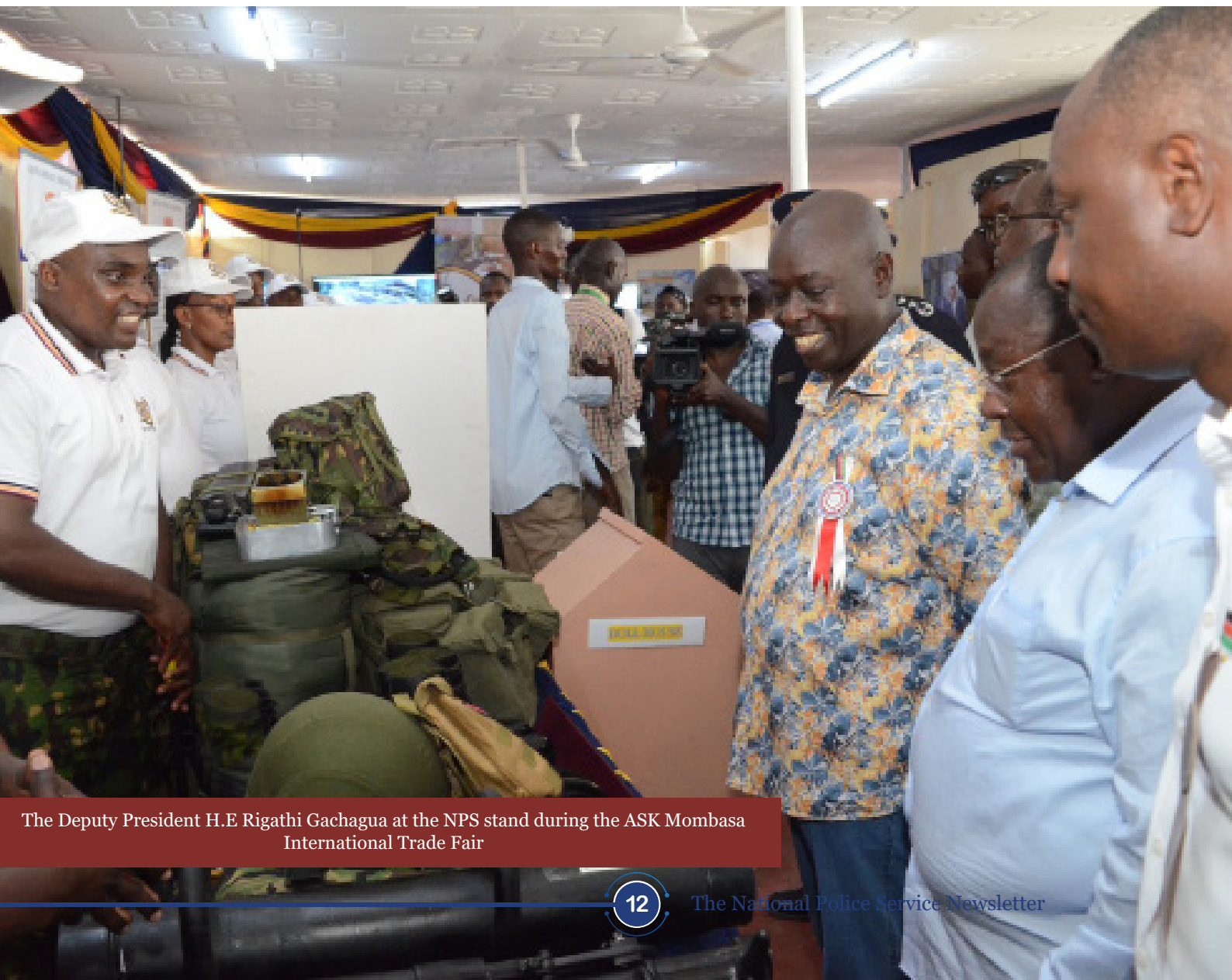
The Deputy President H.E Rigathi Gachagua at the NPS stand during the ASK Mombasa International Trade Fair

NPS reaffirms its commitment to improving service delivery having taken into account the valuable feedback received from the public during the two public engagements.