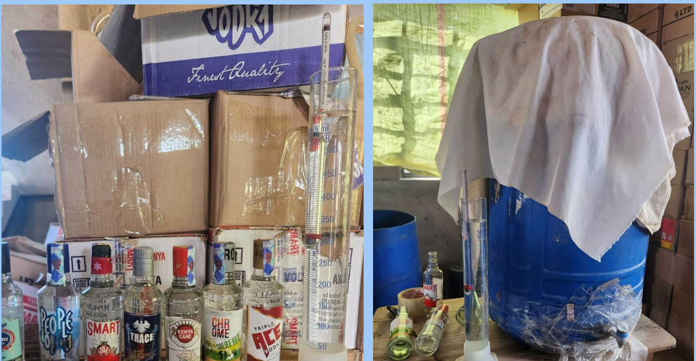
Some of the counterfeit alcoholic drinks seized in Ngatho, Muranga County

NPS lauds members of the public for the continued sharing of information which has led to the arrests and halted the circulation of contraband goods. NPS encourages the public to continue reporting persons who they suspect of involvement in these vices to nearby police posts and stations. These reports can also be made through our toll-free numbers 999, 9,11, 112 and #FichuaKwaDCI 0800 722 203.