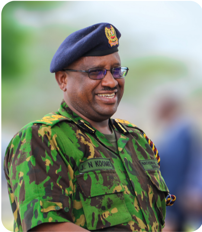
MR. JAPHET KOOME EBS, HSC, NDC 'K' INSPECTOR GENERAL NATIONAL POLICE SERVICE & PRESIDENT OF AFRIPOL GENERAL ASSEMBLY

Dear readers, it is my pleasure to share with you the 8th issue of the National Police Service (NPS) Newsletter. The past three months have seen NPS engage in a myriad of activities that have been vital in ensuring that we effectively and efficiently achieve our policing mandate of maintaining law and order.