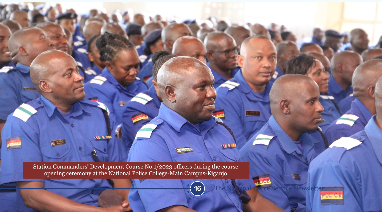
Station Commanders' Development Course No.1/2023 officers during the course opening ceremony at the National Police College-Main Campus-Kiganjo