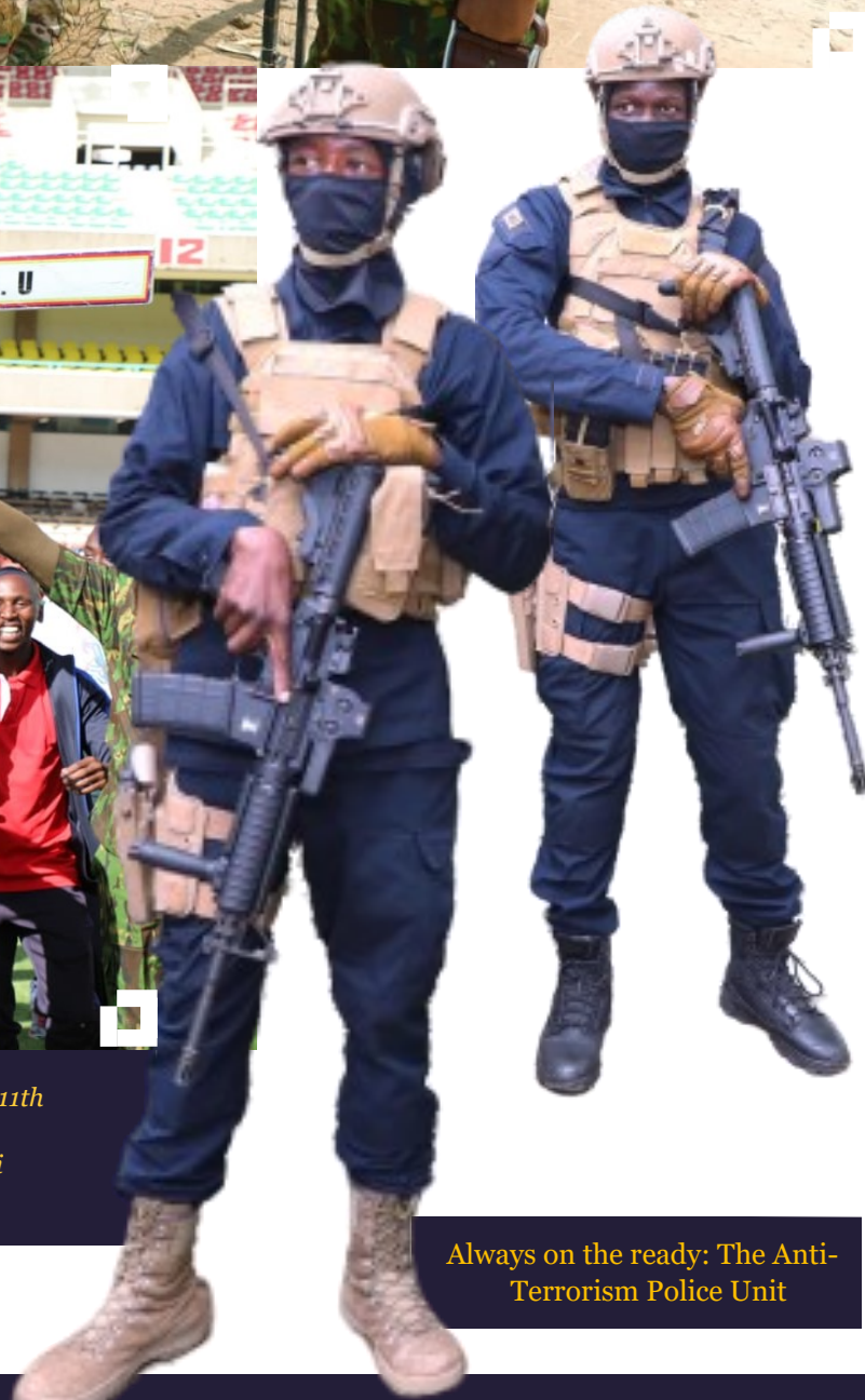
Always on the ready: The Anti-Terrorism Police Unit