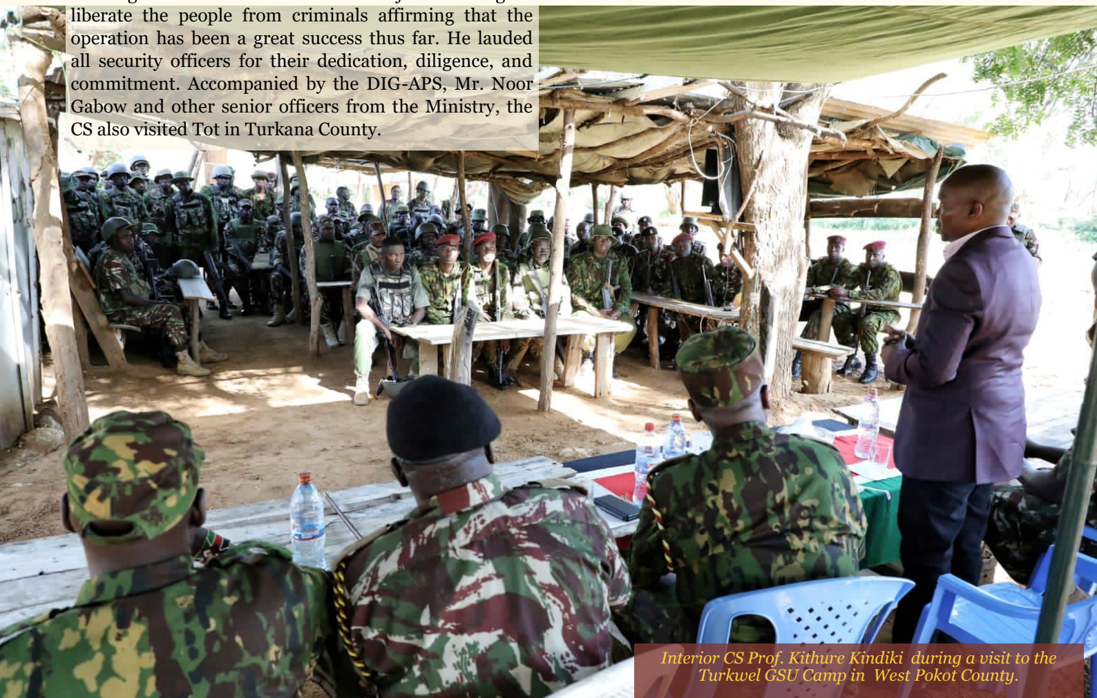
Interior CS Prof. Kithure Kindiki during a visit to the Turkwel GSU Camp in West Pokot County.

More recently, the CS visited Officers at the Turkwel GSU Camp in West Pokot County where he further acknowledged the success of the operation where the multi-agency teams managed to flush out criminals from the forests, caves, gorges, valleys, ravines and escarpments that served as their hideouts while they wreaked havoc or local residents resulting in loss of life, destruction of property and disruption of normalcy. He