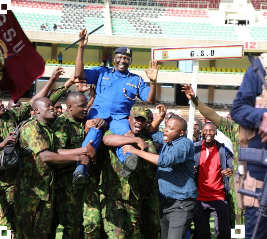
The GSU Tug of War team carries the DIG KPS during the 11th Edition of the National Police Service Track and Field Championship 2023 held on 7th and 8th June at the Moi International Sports Centre, Kasarani.