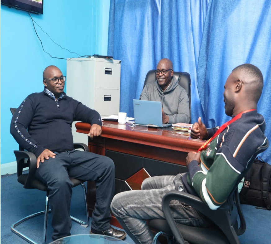
A counselling session at APS Headquarters at Jogoo House

the Christian clergy and the Islamic Imams.