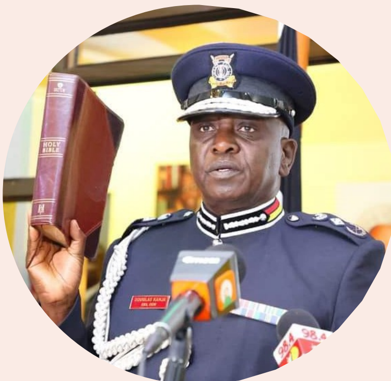
Mr. Douglas Kanja kirocho during his swearing in ceremony presided over by the Chief Justice and President of the Supreme Court, Hon. Lady Justice Martha Koome, as DIG-KPS