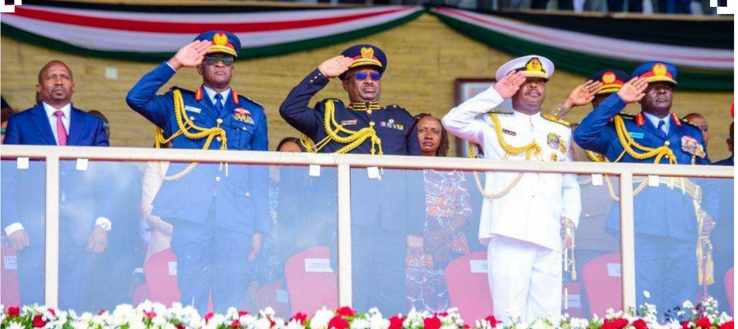
Eng. Japhet Koome attends his first Jamhuri Day Celebrations as the Inspector General NPS at Nyayo Stadium on 12th December, 2022