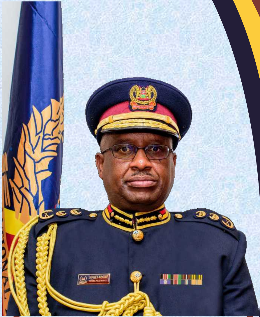
ENG. JAPHET KOOME EBS, HSC, ndc 'K' INSPECTOR GENERAL NATIONAL POLICE SERVICE

As you join us in this edition, let me wish you and your families, Merry Christmas and Prosperous New Year 2023. May God Bless you all.