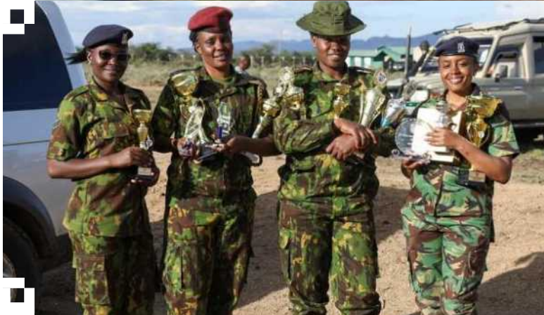
NPS ladies win big at the 83rd Kenya Open Shooting competition held from November 27 to December 4 at the Kenya Defence Forces Rifle Range in Nanyuki, Laikipia County