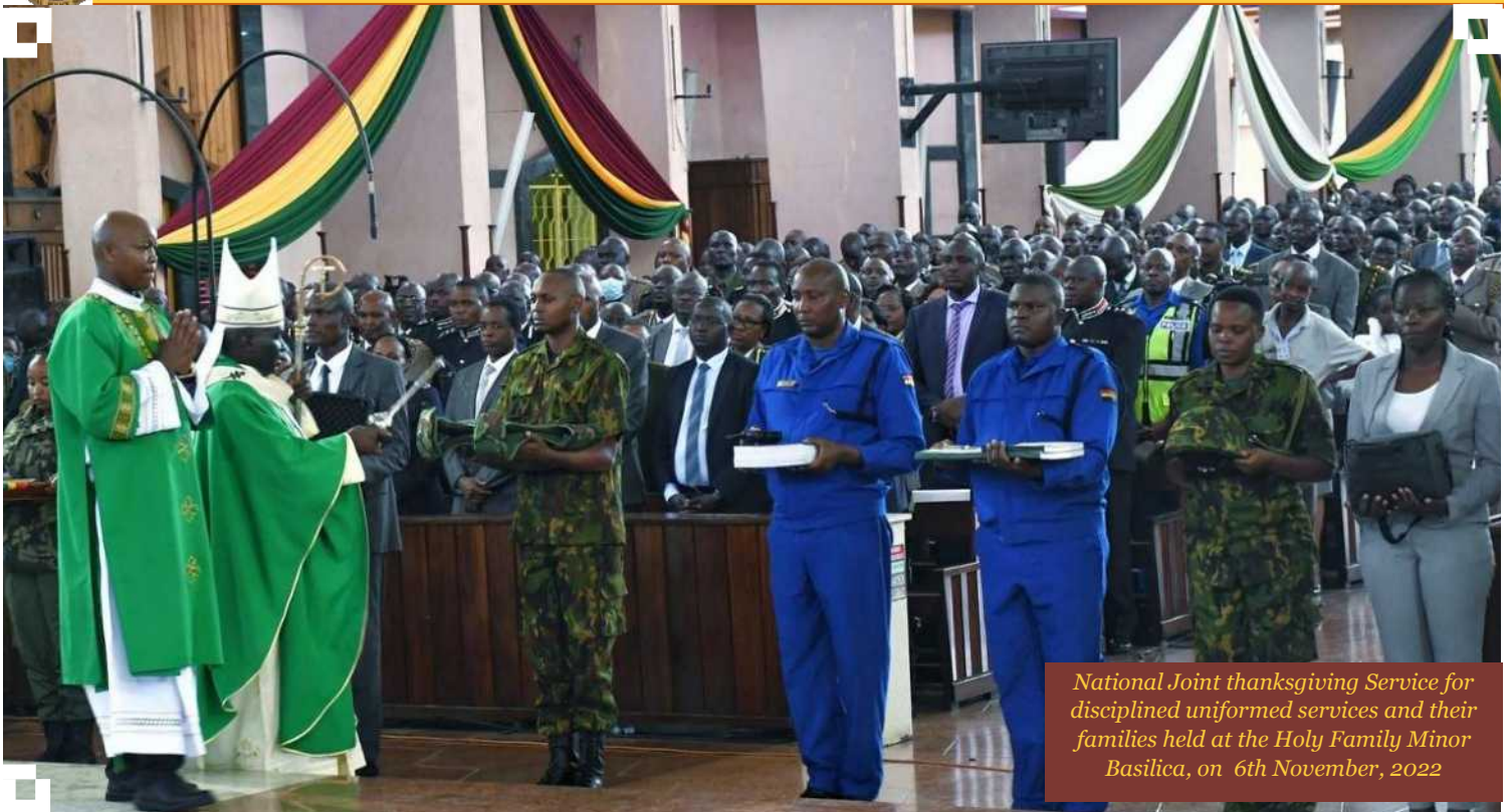
National Joint thanksgiving Service for disciplined uniformed services and their families held at the Holy Family Minor Basilica, on 6th November, 2022