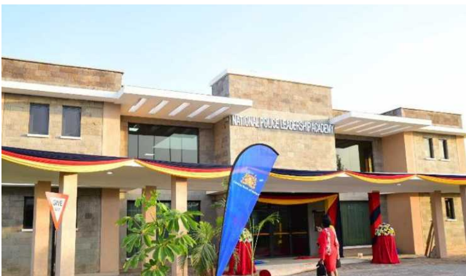
National Police Leadership Academy

In accordance with the law, NPS is committed to pursuing advanced, job-specific education aimed at equipping officers with requisite skills and knowledge suitable for modern policing.