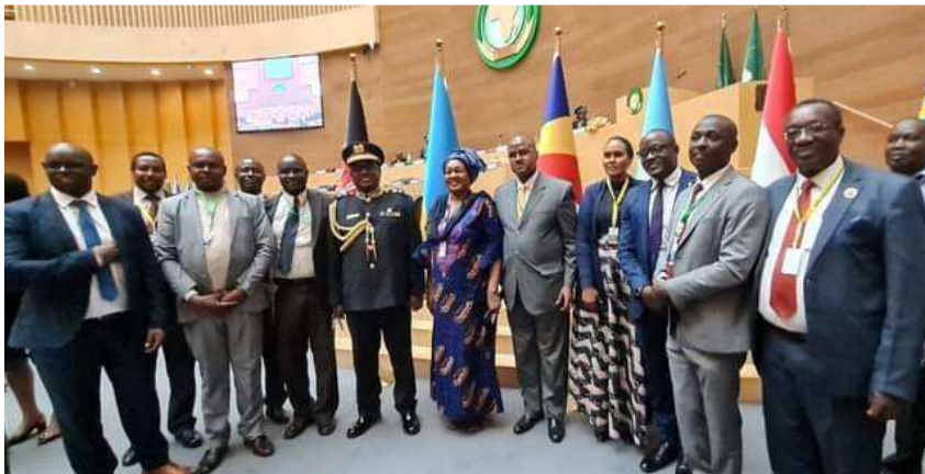
The Inspector-General and President of AFRIPOL Mr Japhet Koome and Kenyan Delegation at the 24th annual general meeting of the EAPCCO held in Addis Ababa

Member Countries of EAPCCO have been conducting joint operations in Eastern Africa and beyond since 2010. These include Operation Usalama which targets human and arms trafficking, Operation Lionfish Mihadarati targeting drug trafficking networks in the region among others.