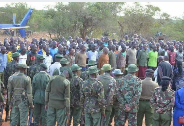
Residents of Samburu County, NGAO officers and security officers receiving a security update during the launch of the National Police Reservists Programme for Samburu County

Hon. Kindiki lauded the multiagency approach noting that a multi-pronged approach is one way to a long lasting solution to the recurring conflicts in the disturbed areas. To complement efforts by the police, the CS launched specialized training for 300 National Police Reservists (NPR) in Samburu County.