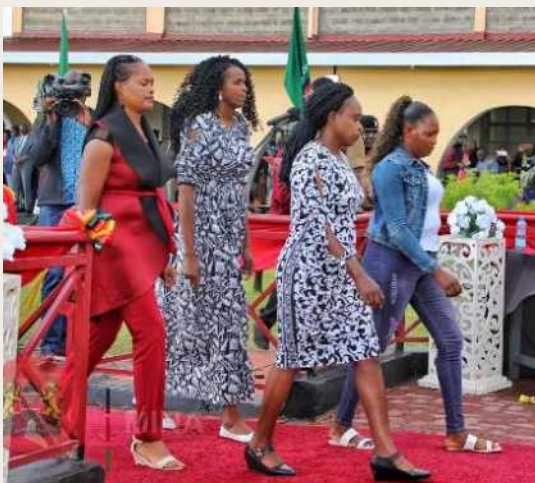
Widows of Fallen Heroes at NPC Embakasi "A" Campus in Dec 2022

President William Samoei Ruto to the bereaved families. He assured he will take unprecedented measures to support officers who serve in extremely difficult conditions and their families during their service and even in the unfortunate event of death.