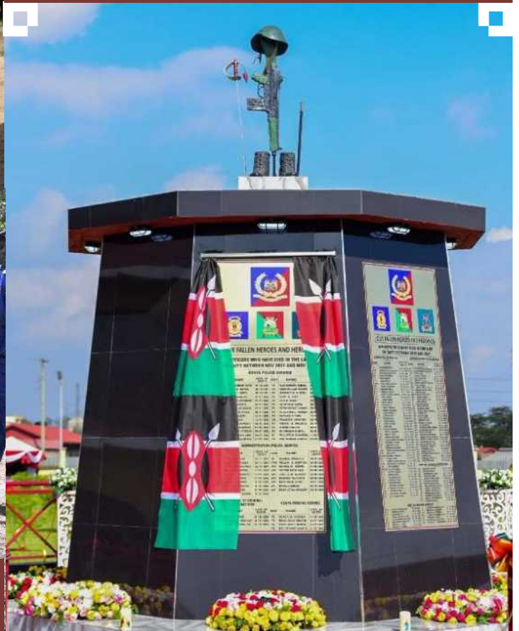
In remembrance of our fallen heroes