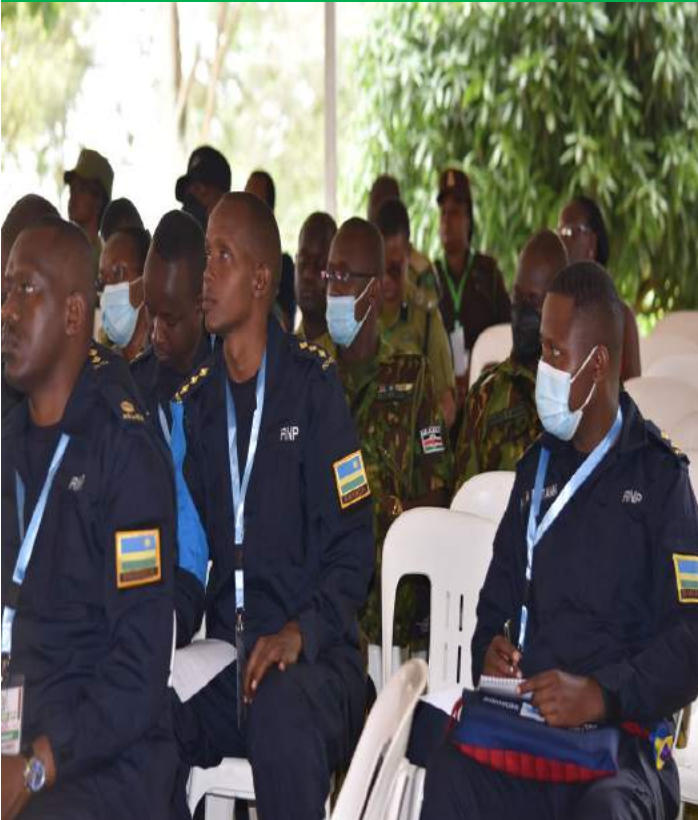
Rwanda National Police (RNP) participants during the opening session