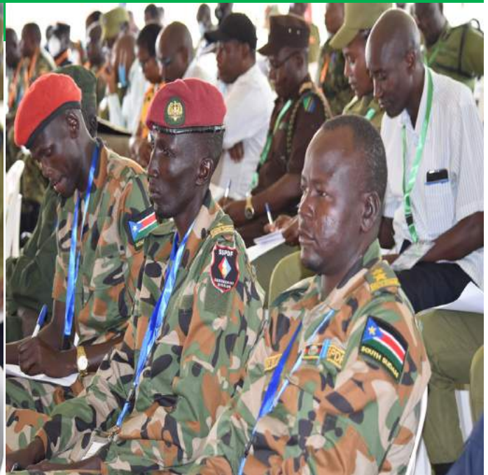
South Sudan People Defense Forces (SSPDF) participants during the opening session.