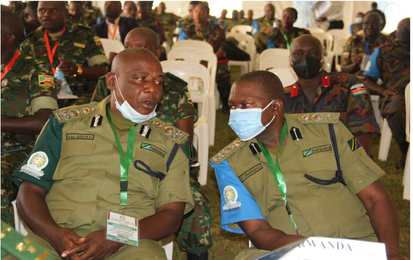
Seniors Police Officers from Tanzania share ideas during the Clinic session of the exercise