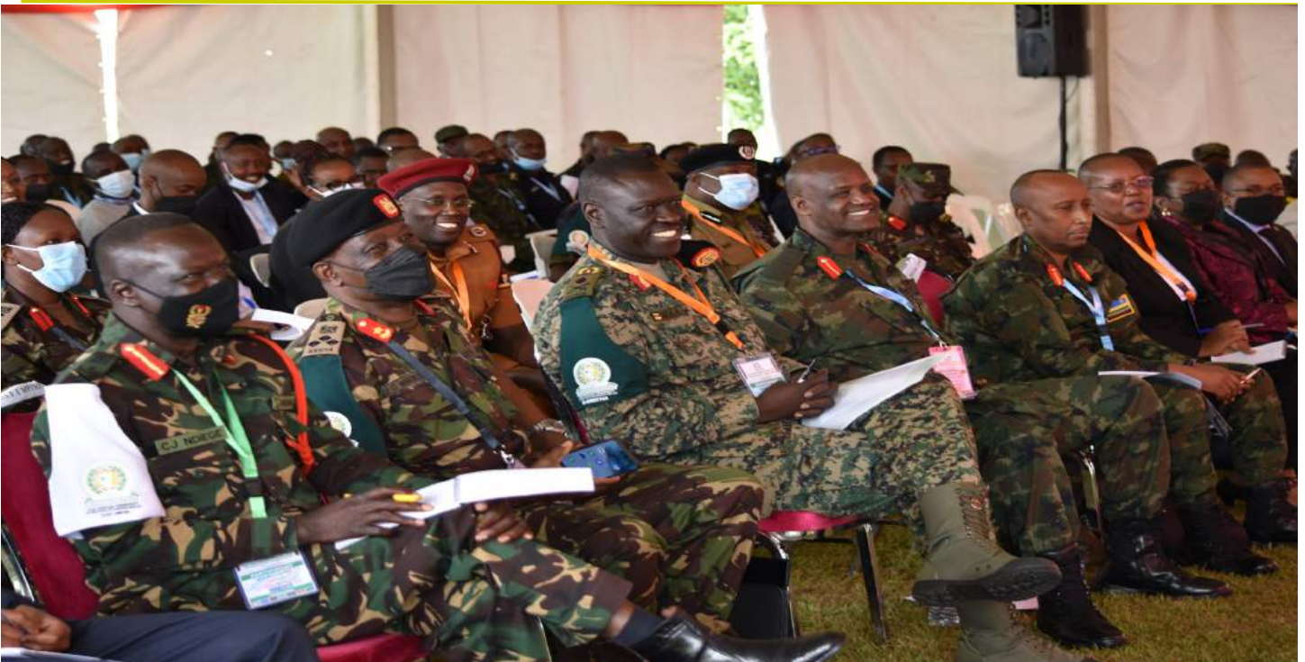
Participants of the EAC Ushirikiano Imara FTX take notes during the pre - exercise opening session