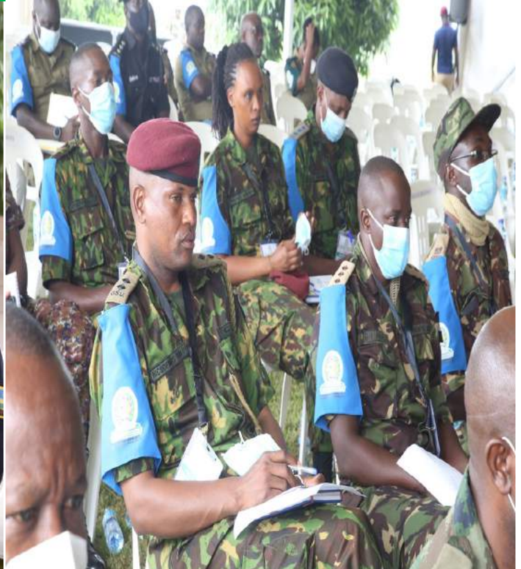
Kenya National Police Service (K-NPS) participants during the opening session