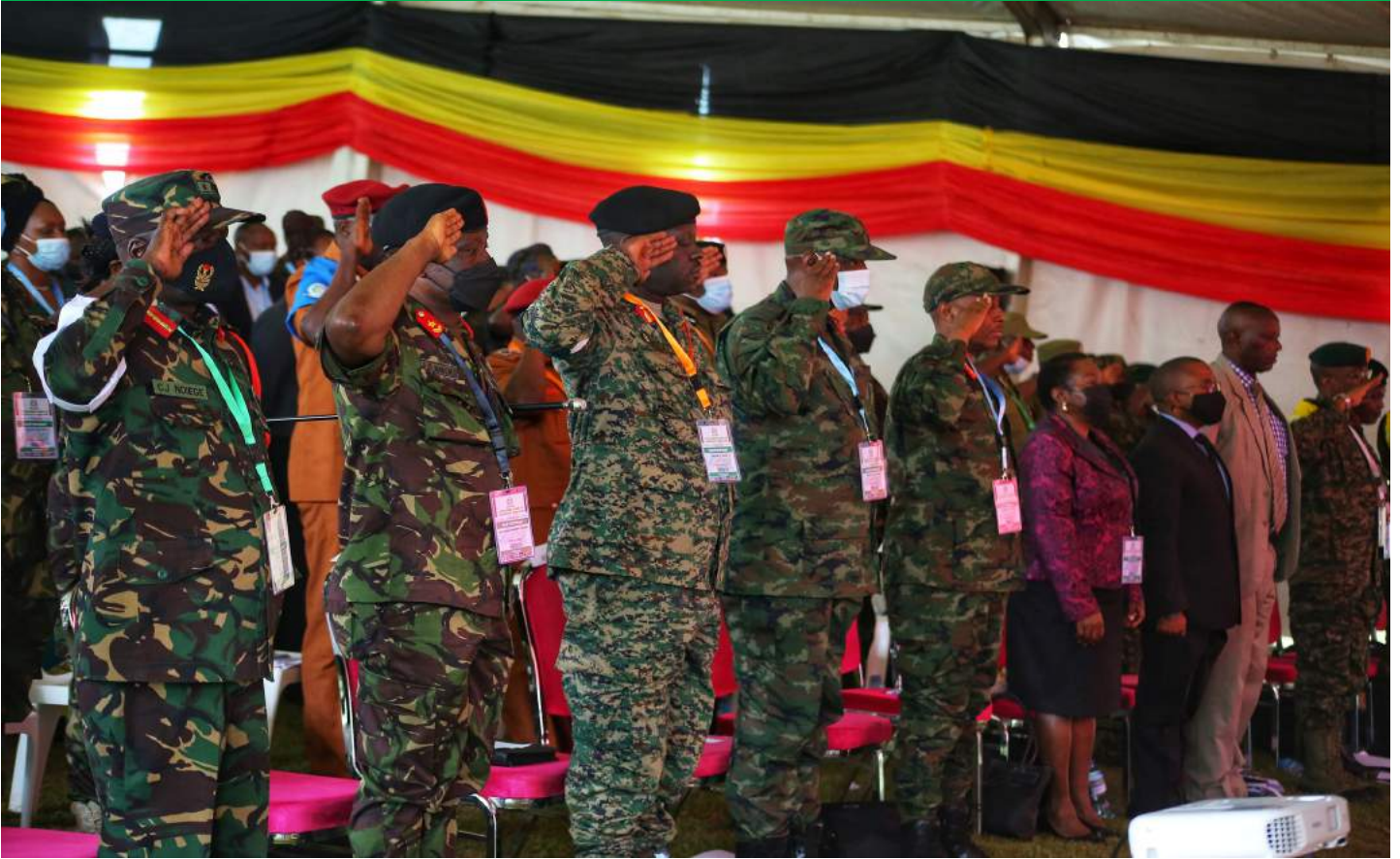
Some of the Exercise Participants salutes during the EAC Anthem.