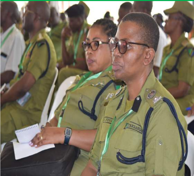
Tanzania Police Force participants during the opening session.